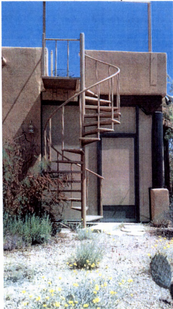
Left Side View (taken April 4, 2015)

If submitting more photographs than will fit on the preceding page, affix the additional photographs below. Identify all photographs with: date taken; "Front View" and "Rear View"; and, if required, "Right Side View" and "Left Side View." When applicable, photographs must show the foundation with representative examples of the flood openings or vents, as indicated in Section A8.