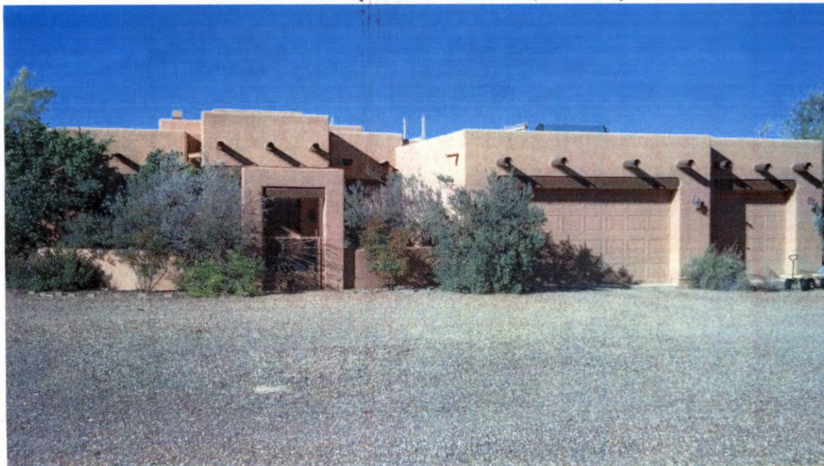
Right Side View (taken June 3, 2015)