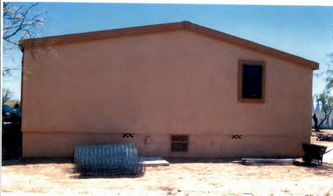
Right Side west