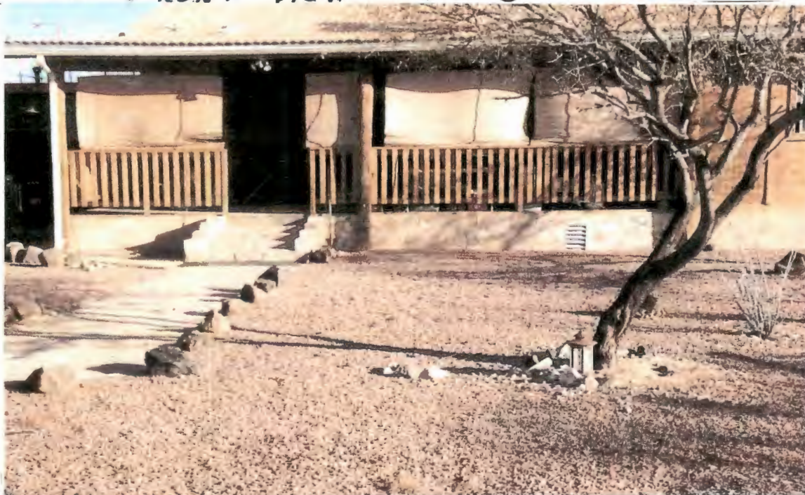
Photo Two Caption REAR VIEW 1-24-18