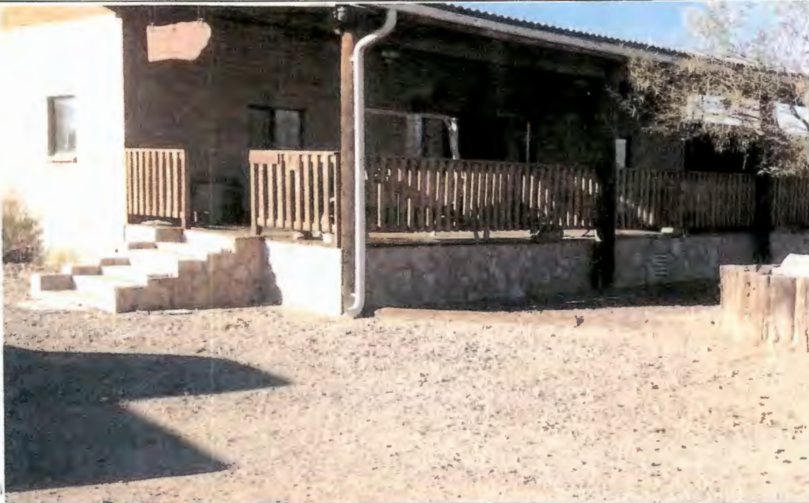
Photo One Caption FRONT VIEW 1-24-18

If using the Elevation Certificate to obtain NFIP flood insurance, affix at least 2 building photographs below according to the instructions for Item A6. Identify all photographs with date taken; "Front View" and "Rear View"; and, if required, "Right Side View" and "Left Side View." When applicable, photographs must show the foundation with representative examples of the flood openings or vents, as indicated in Section A8. If submitting more photographs than will fit on this page, use the Continuation Page.