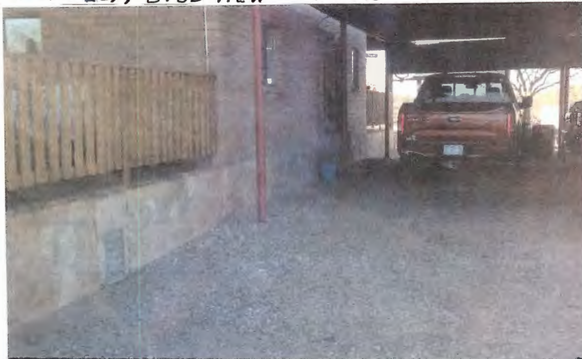
Photo Four Caption RIGHT SIDE VIEW 1-24-18