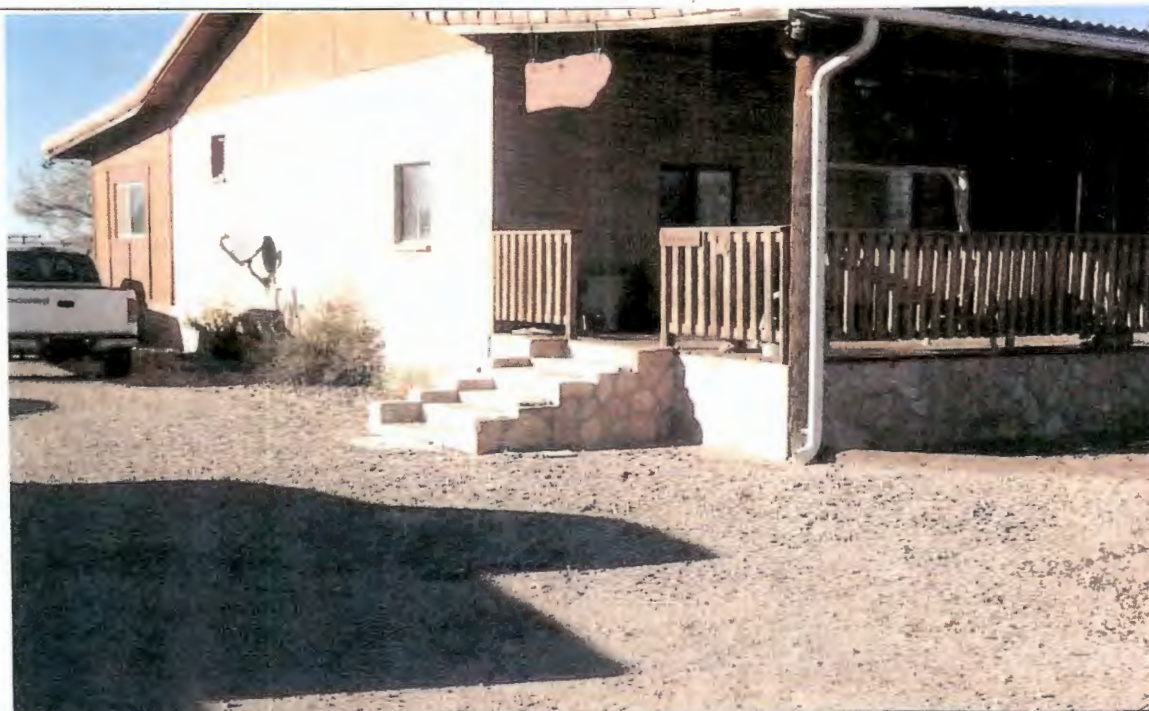
Photo Three Caption LEFT SIDE VIEW 1-24-18

If submitting more photographs than will fit on the preceding page, affix the additional photographs below. Identify all photographs with: date taken; "Front View" and "Rear View"; and, if required, "Right Side View" and "Left Side View." When applicable, photographs must show the foundation with representative examples of the flood openings or vents, as indicated in Section A8.