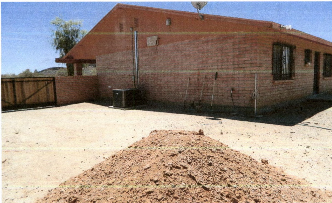
RIGHT SIDE VIEW 6-29-14

If submitting more photographs than will fit on the preceding page, affix the additional photographs below. Identify all photographs with: date taken; "Front View" and "Rear View"; and, if required, "Right Side View" and "Left Side View." When applicable, photographs must show the foundation with representative examples of the flood openings or vents, as indicated in Section A8.