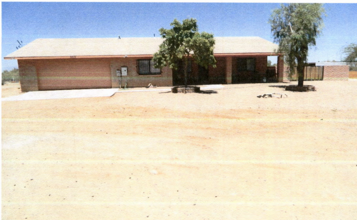
FRONT SIDE VIEW 6-29-14

If using the Elevation Certificate to obtain NFIP flood insurance, affix at least 2 building photographs below according to the instructions for Item A6. Identify all photographs with date taken; "Front View" and "Rear View"; and, if required, "Right Side View" and "Left Side View." When applicable, photographs must show the foundation with representative examples of the flood openings or vents, as indicated in Section A8. If submitting more photographs than will fit on this page, use the Continuation Page.