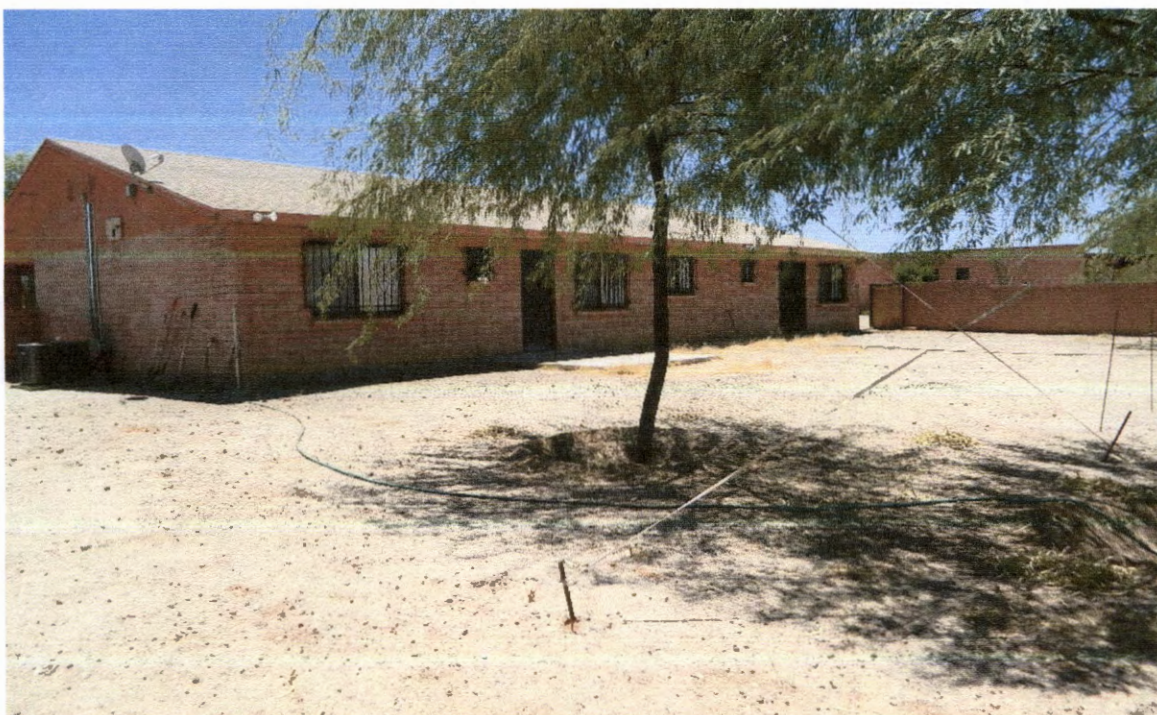
REAR SIDE VIEW 6-29-14

If using the Elevation Certificate to obtain NFIP flood insurance, affix at least 2 building photographs below according to the instructions for Item A6. Identify all photographs with date taken; "Front View" and "Rear View"; and, if required, "Right Side View" and "Left Side View." When applicable, photographs must show the foundation with representative examples of the flood openings or vents, as indicated in Section A8. If submitting more photographs than will fit on this page, use the Continuation Page.