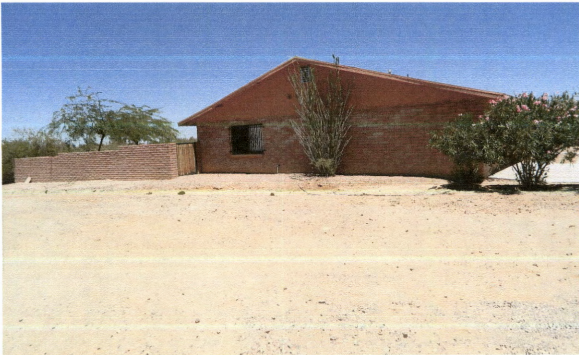
LEFT SIDE VIEW 6-29-14

If using the Elevation Certificate to obtain NFIP flood insurance, affix at least 2 building photographs below according to the instructions for Item A6. Identify all photographs with date taken; "Front View" and "Rear View"; and, if required, "Right Side View" and "Left Side View." When applicable, photographs must show the foundation with representative examples of the flood openings or vents, as indicated in Section A8. If submitting more photographs than will fit on this page, use the Continuation Page.