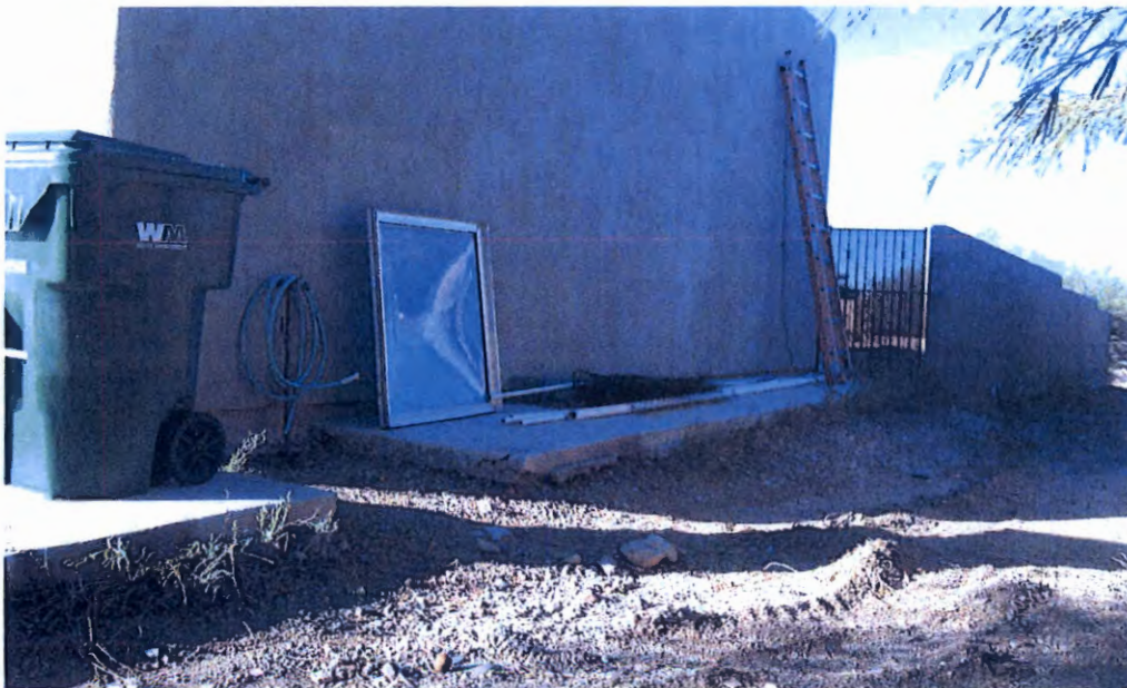
South View (Right Side), Dec. 6, 2011