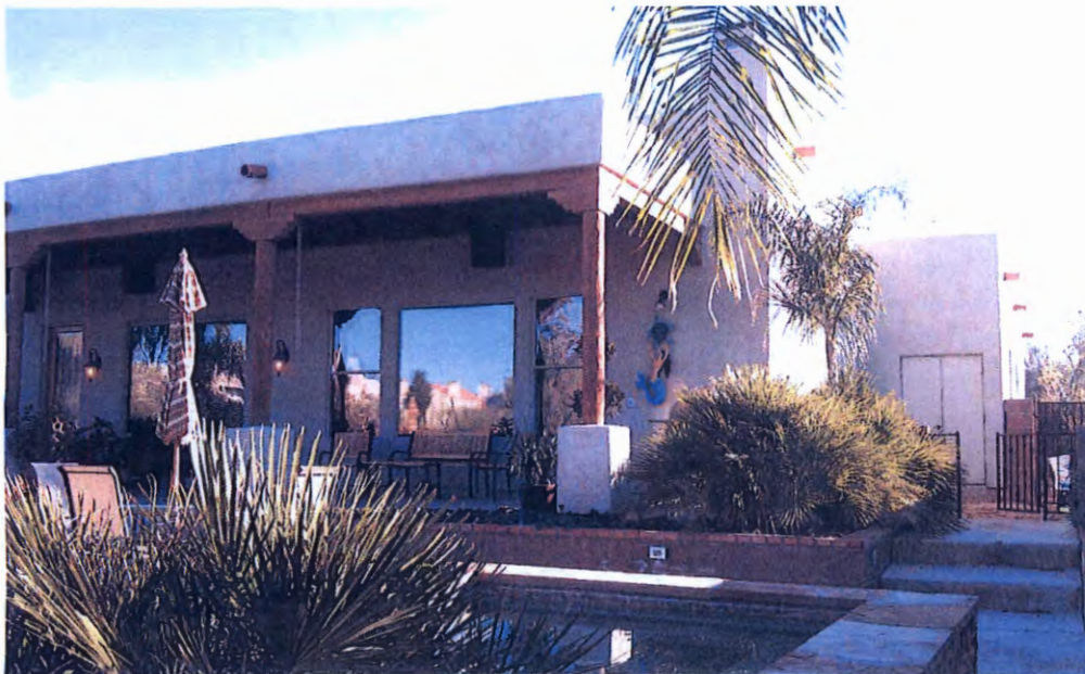
East View (Rear), Dec. 6, 2011