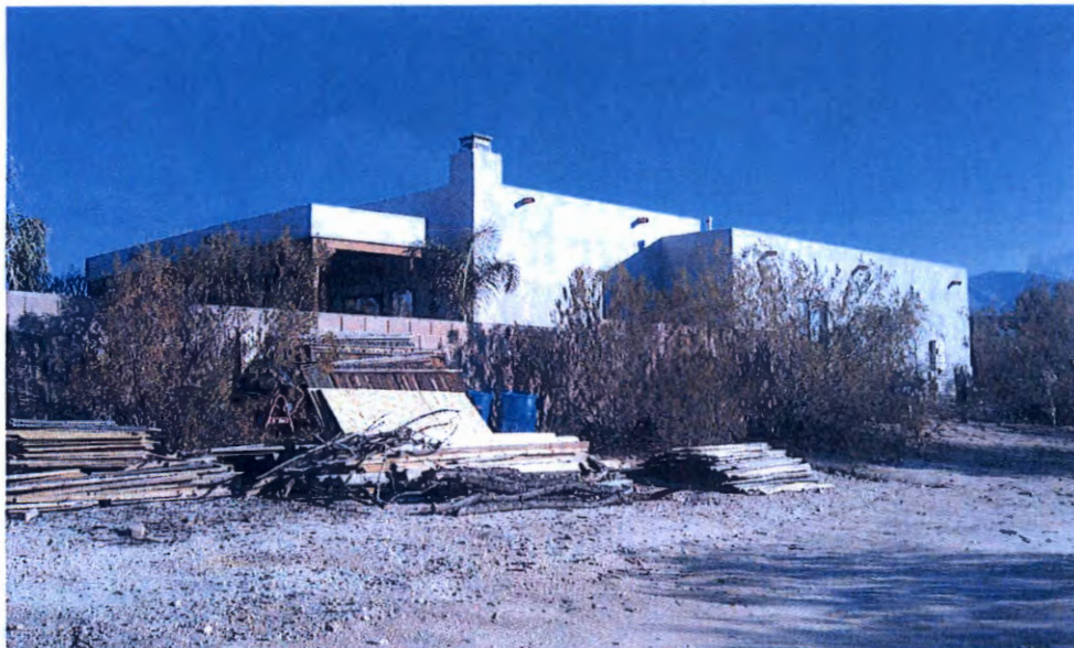
North View (Left Side), Dec. 6, 2011