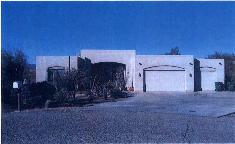
West View (Front side), Dec. 6, 2011