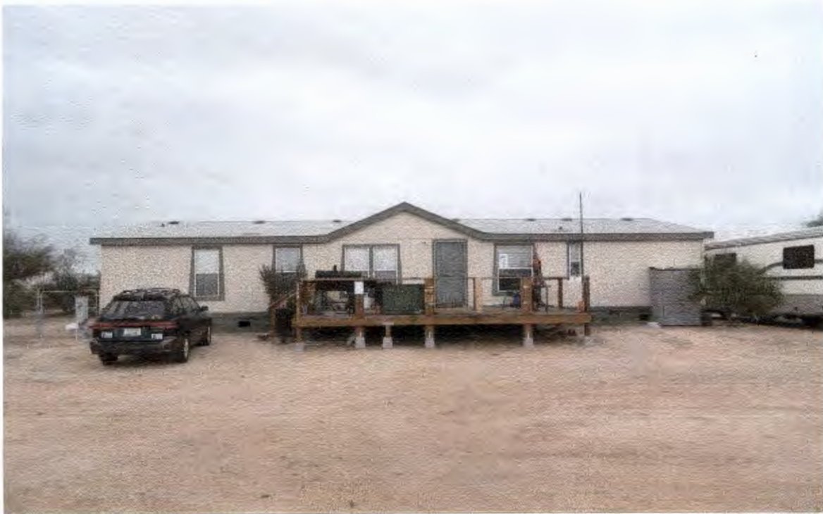
FRONT SIDE VIEW

If using the Elevation Certificate to obtain NFIP flood insurance, affix at least 2 building photographs below according to the instructions for Item A6. Identify all photographs with date taken; "Front View" and "Rear View"; and, if required, "Right Side View" and "Left Side View." When applicable, photographs must show the foundation with representative examples of the flood openings or vents, as indicated in Section A8. If submitting more photographs than will fit on this page, use the Continuation Page.