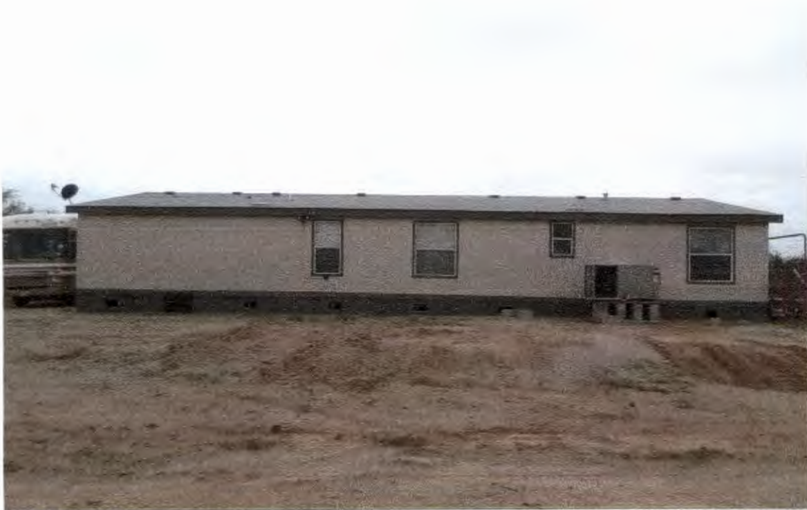
REAR SIDE VIEW

If using the Elevation Certificate to obtain NFIP flood insurance, affix at least 2 building photographs below according to the instructions for Item A6. Identify all photographs with date taken; "Front View" and "Rear View"; and, if required, "Right Side View" and "Left Side View." When applicable, photographs must show the foundation with representative examples of the flood openings or vents, as indicated in Section A8. If submitting more photographs than will fit on this page, use the Continuation Page.