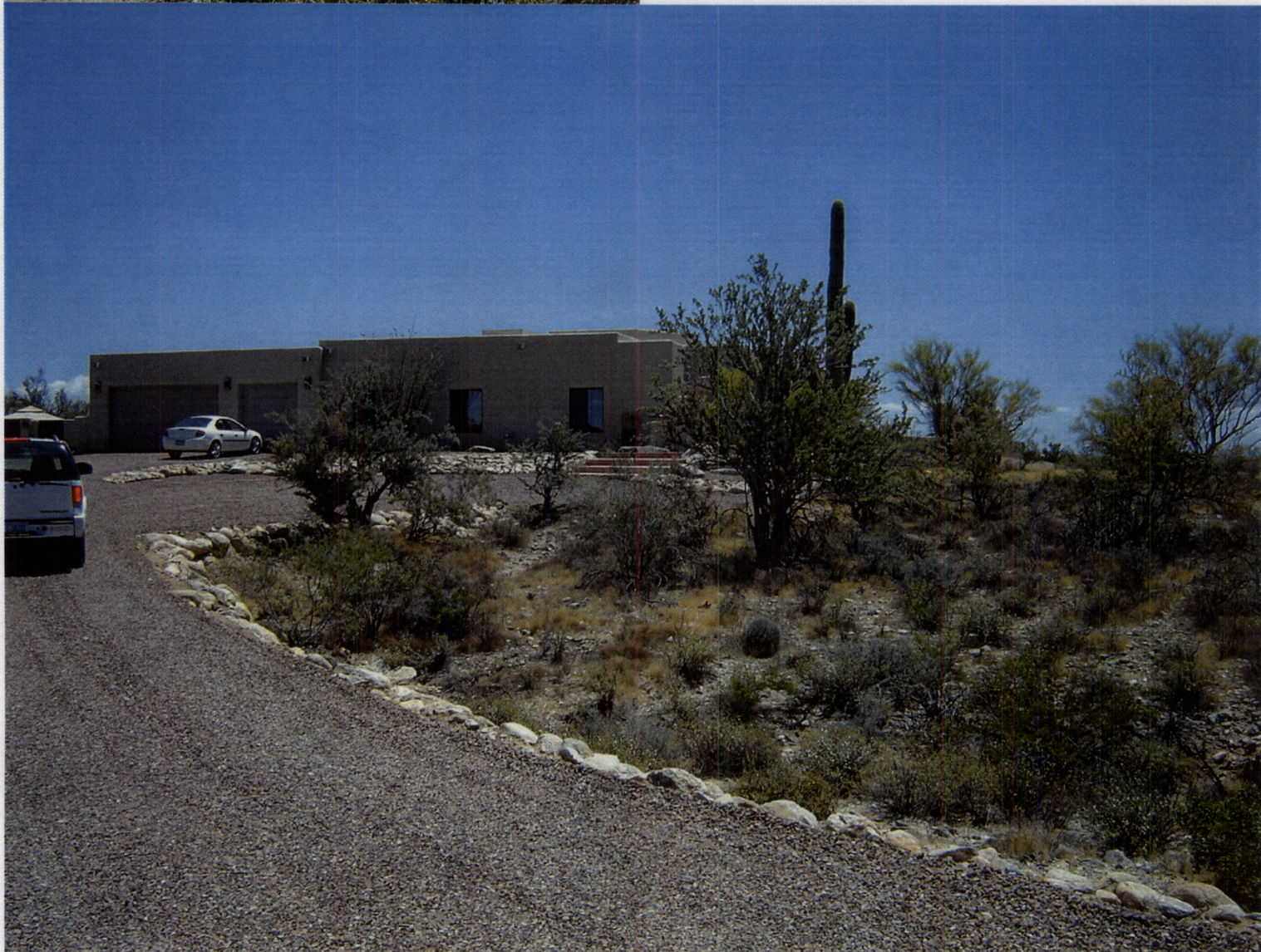
9710 N. Linda Vista Place; fpup 03-209; 216-35-0730; 04-26-05