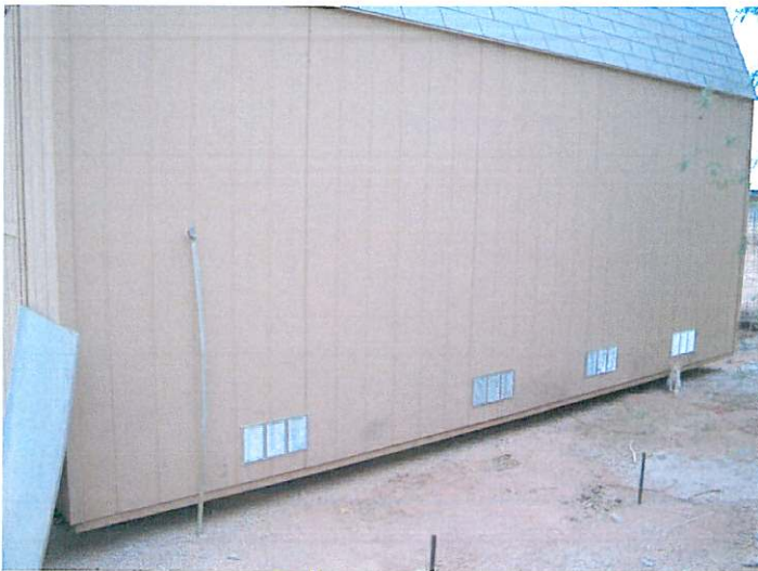
WEST DAK EAST FACE