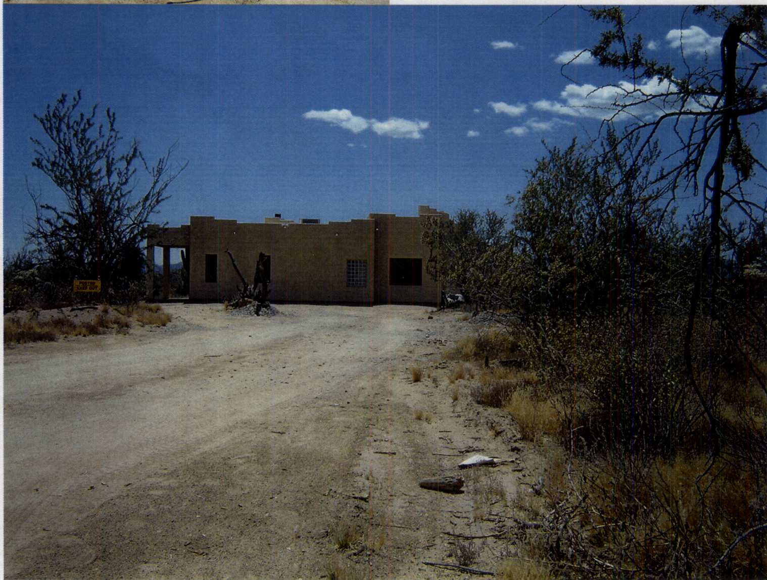
4945 W. Sumter Drive; fpup 04-063; 216-31-034D; 04-26-05