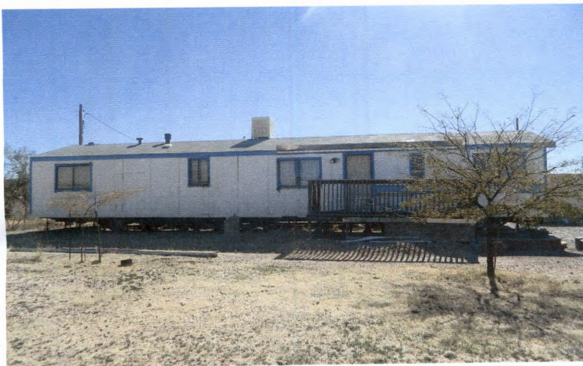
FRONT VIEW 1/25/2014

If using the Elevation Certificate to obtain NFIP flood insurance, affix at least 2 building photographs below according to the instructions for Item A6. Identify all photographs with date taken; "Front View" and "Rear View"; and, if required, "Right Side View" and "Left Side View." When applicable, photographs must show the foundation with representative examples of the flood openings or vents, as indicated in Section A8. If submitting more photographs than will fit on this page, use the Continuation Page.