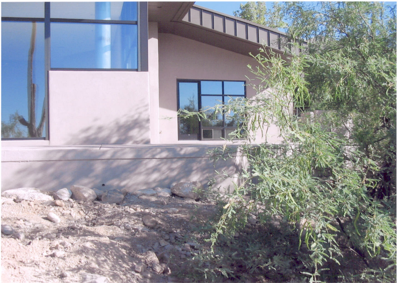
S Side looking N 7 6/25/07 East Side Looking W 9