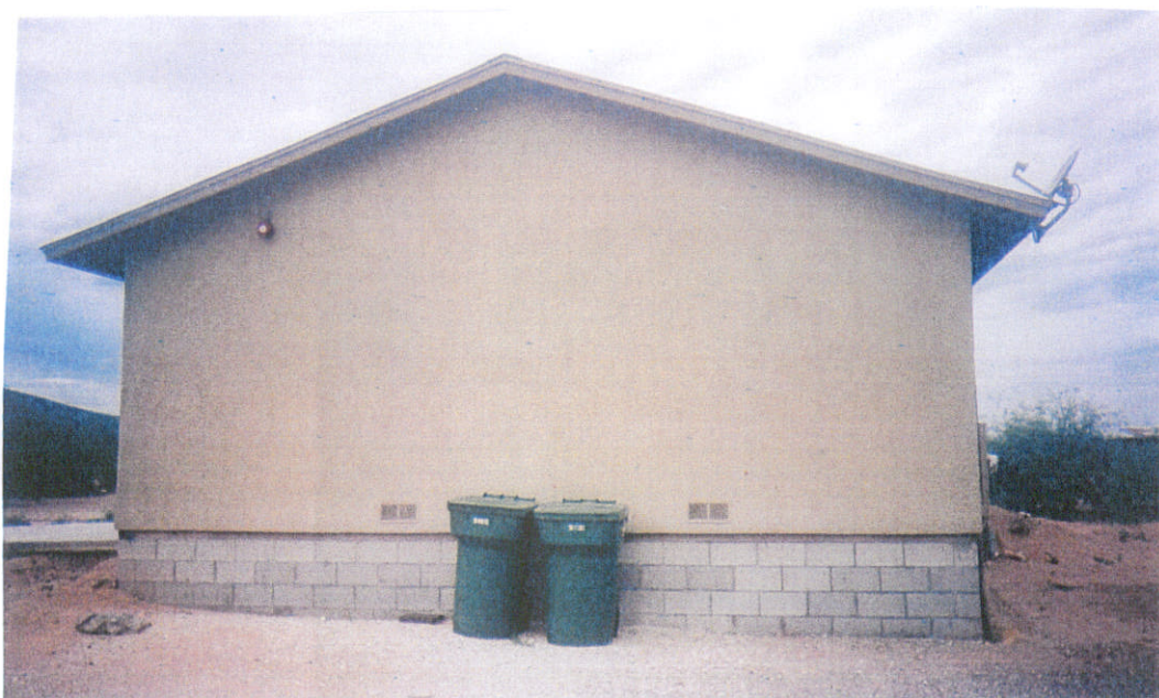
Right Side (East)