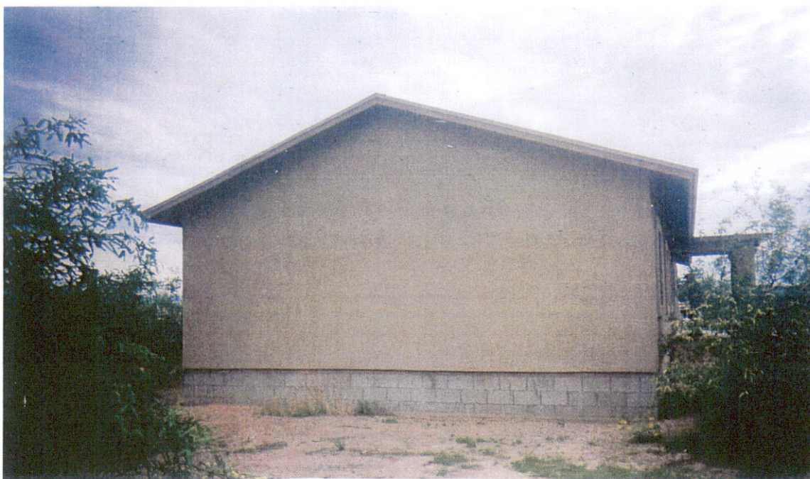
Left Side (West)