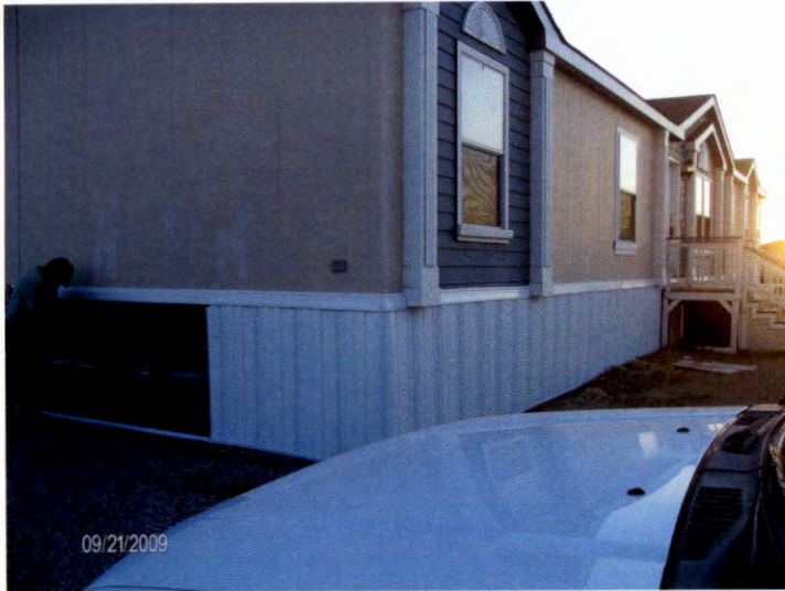
9/21/2009 17134 W CALLE CARMELA SW COR