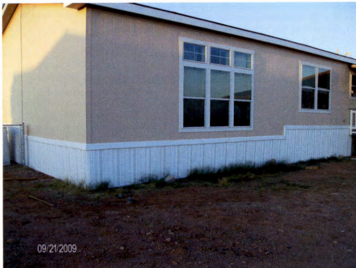
9/21/2009 17134 W CALLE CARMELA NE COR