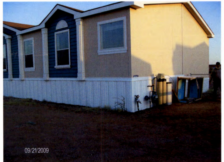
9/21/2009 17134 W CALLE CARMELA SE COR