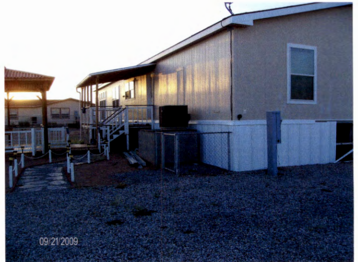
9/21/2009 17134 W CALLE CARMELA NW COR