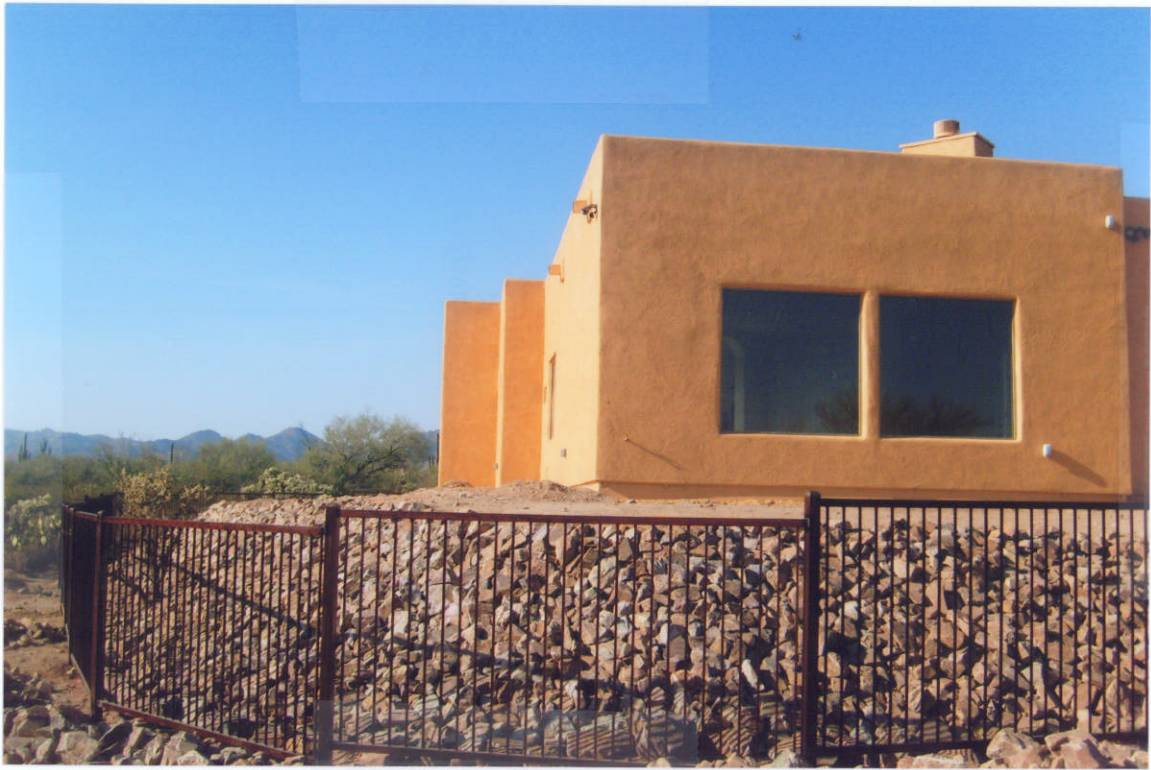
04-17-04 WEST SIDE