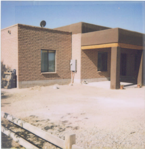
1821 W. ELVIRA 6/29/07 NE CORNER