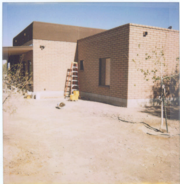
1821 W. ELVIRA 6/29/07 SE CORNER