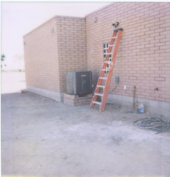
1821 W. ELVIRA 6/29/07 AC UNIT W. SIDE