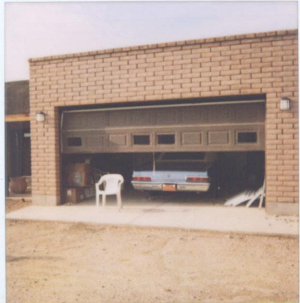
1821 W. ELVIRA 7/26/07 GARAGE DOOR W/VEHICLE