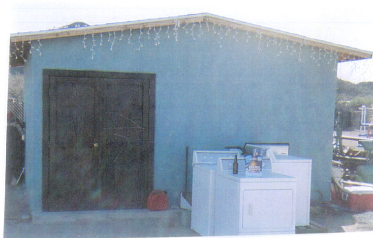
West side (Front)