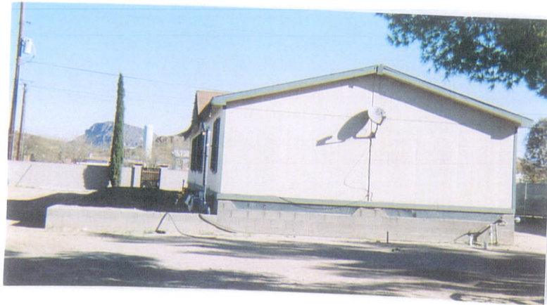
South side (Right Side)

If using the Elevation Certificate to obtain NFIP flood insurance, affix at least two building photographs below according to the instructions for Item A6. Identify all photographs with: date taken; "Front View" and "Rear View"; and, if required, "Right Side View" and "Left Side View." If submitting more photographs than will fit on this page, use the Continuation Page, following.