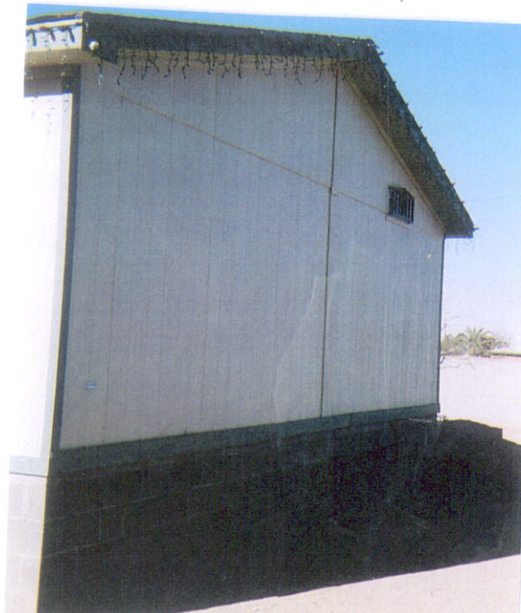
North side (Left Side)