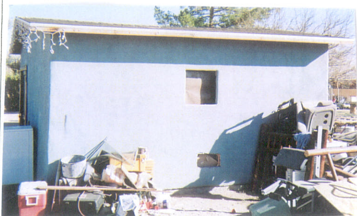
South side (Right)