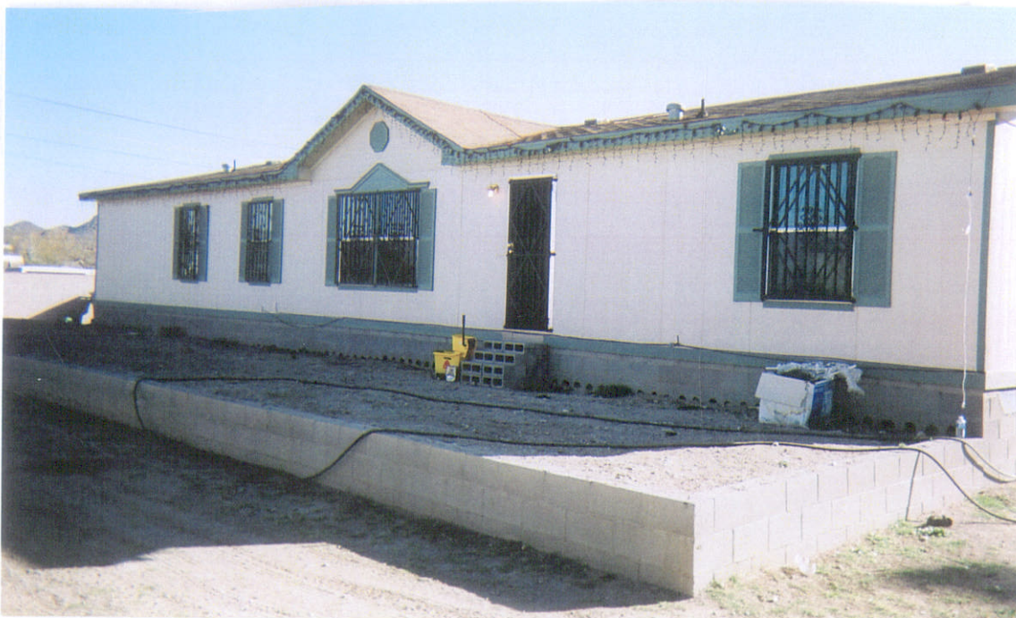
West Side Front