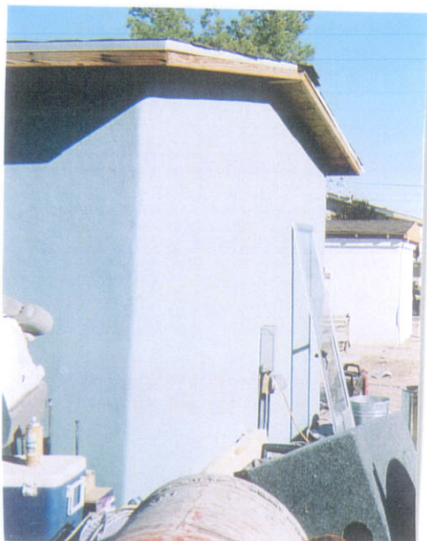
East side (Back)

If using the Elevation Certificate to obtain NFIP flood insurance, affix at least two building photographs below according to the instructions for Item A6. Identify all photographs with: date taken; "Front View" and "Rear View"; and, if required, "Right Side View" and "Left Side View." If submitting more photographs than will fit on this page, use the Continuation Page, following.