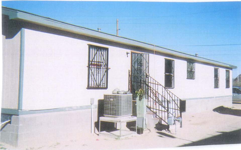
East Side Back

If using the Elevation Certificate to obtain NFIP flood insurance, affix at least two building photographs below according to the instructions for Item A6. Identify all photographs with: date taken; "Front View" and "Rear View"; and, if required, "Right Side View" and "Left Side View." If submitting more photographs than will fit on this page, use the Continuation Page, following.