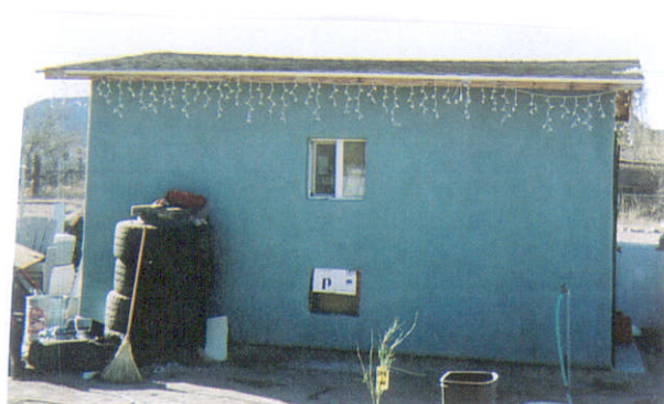
North side (Left)