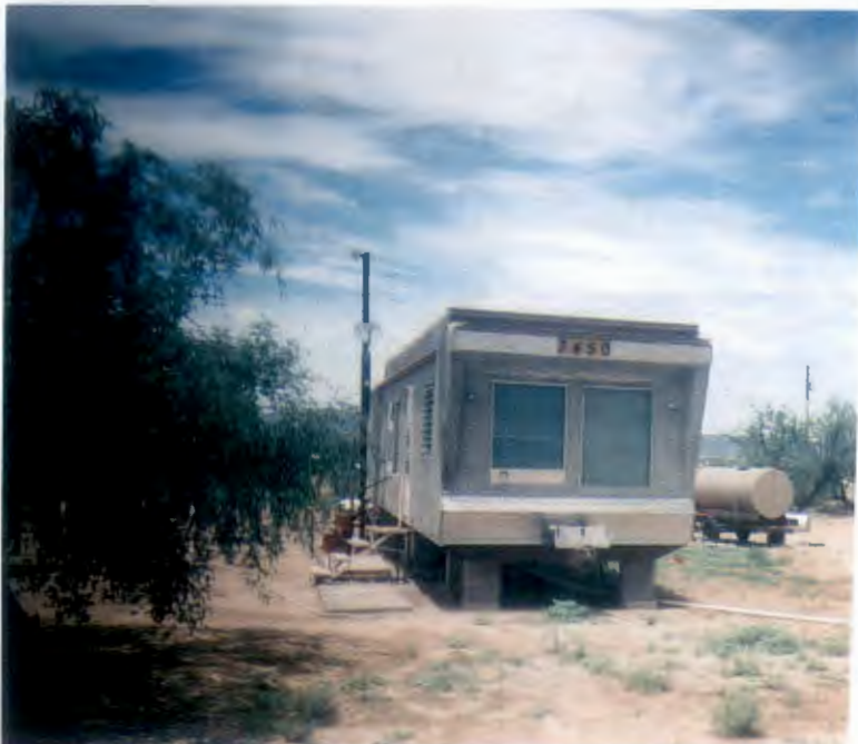
Right Side (East)