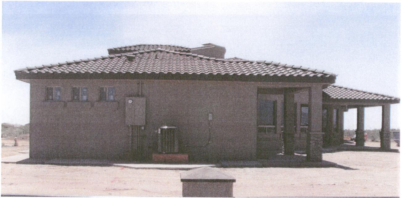
Date: 6/15/09 Right Side View