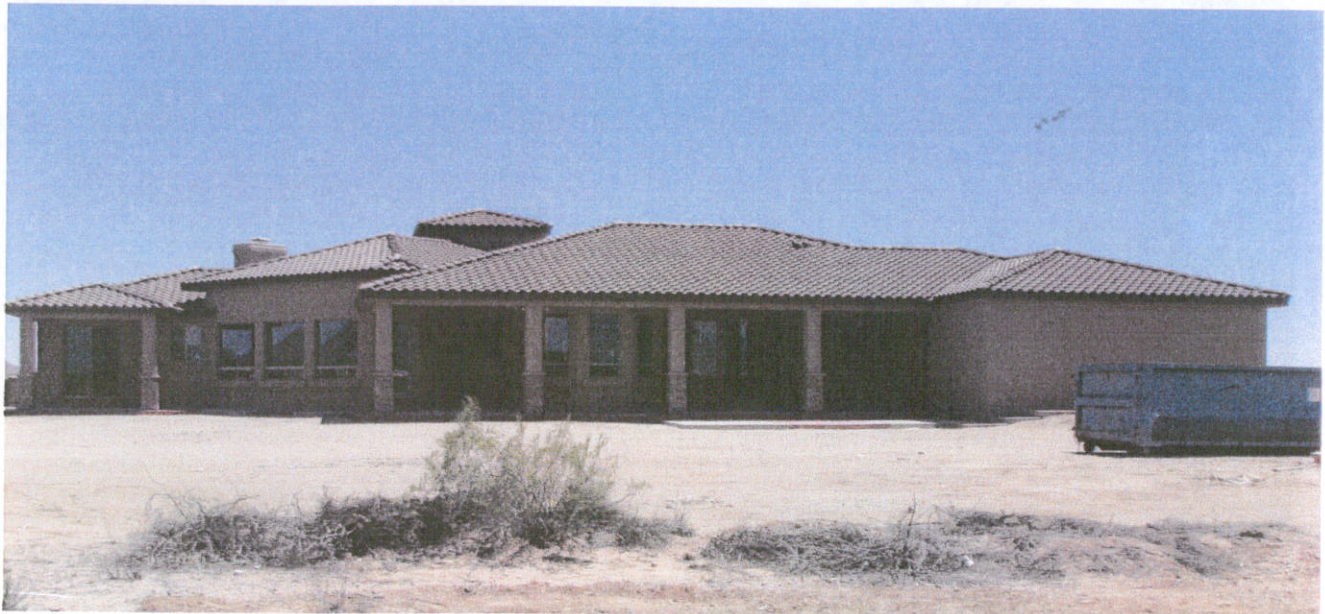
Date: 6/15/09 Rear View