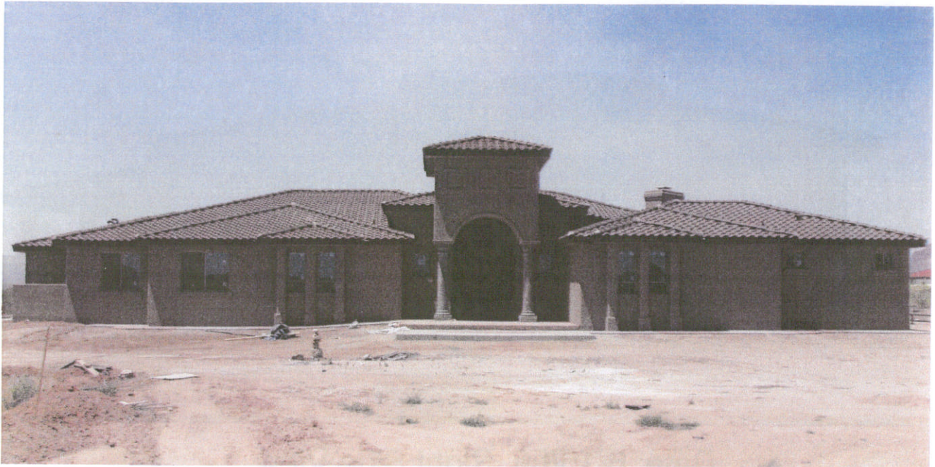
Date: 6/15/09 Front View