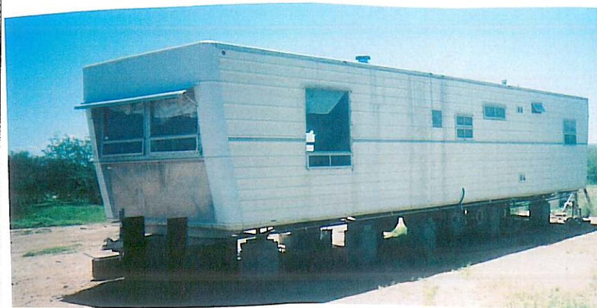
Right Side (West)