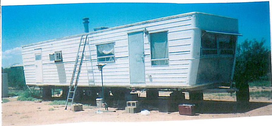
Left Side (East)

If using the Elevation Certificate to obtain NFIP flood insurance, affix at least two building photographs below according to the instructions for Item A6. Identify all photographs with: date taken; "Front View" and "Rear View"; and, if required, "Right Side View" and "Left Side View." If submitting more photographs than will fit on this page, use the Continuation Page, following.