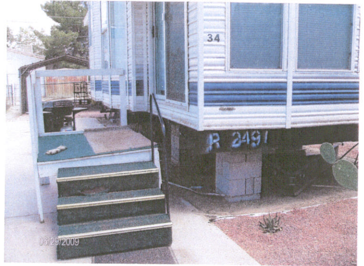
6/29/2009 3019 W. EMERALD NW COR