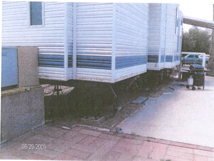
6/29/2009 3019 W. EMERALD NE COR