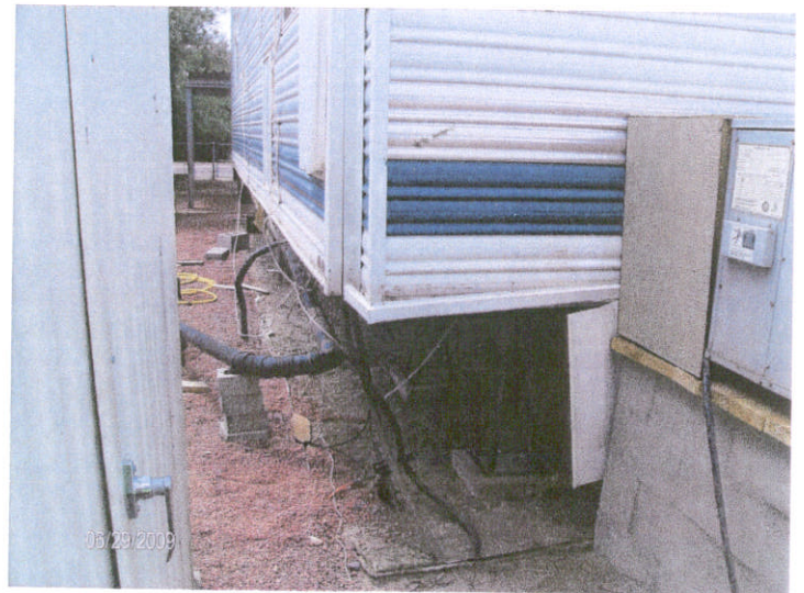
6/29/2009 3019 W. EMERALD SE COR