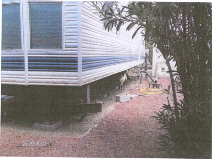
6/29/2009 3019 W. EMERALD SW COR