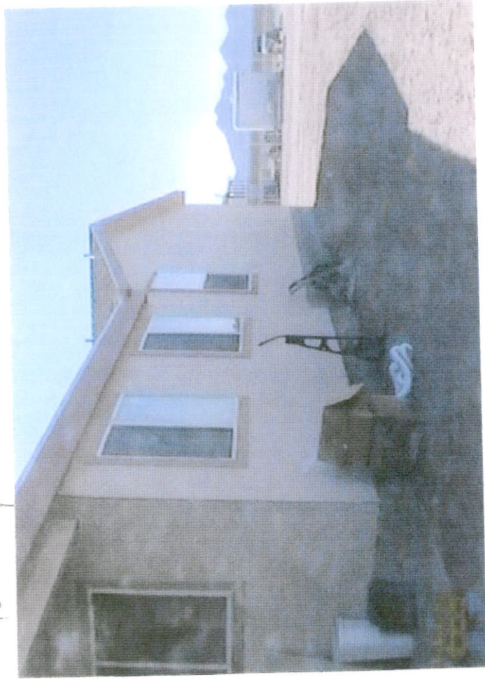
17110 W CALLE CANMELA ARIZONA ROOM