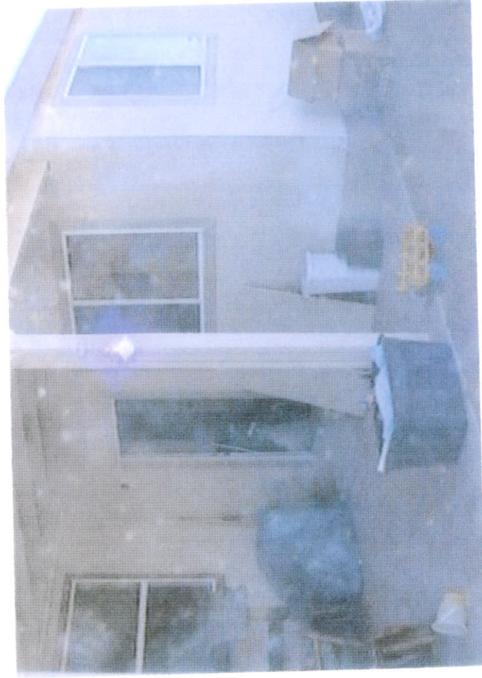
17110 W CALLE CANMELA ARIZONA ROOM