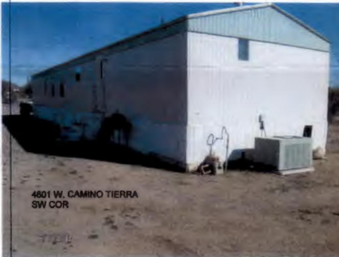
4601 W. CAMINO TIERRA SW COR