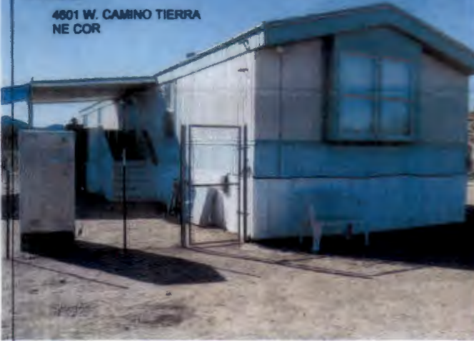
4601 W. CAMINO TIERRA NE COR