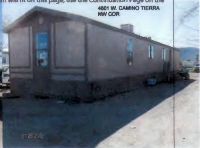
4801 W. CAMINO TIERRA NW COR