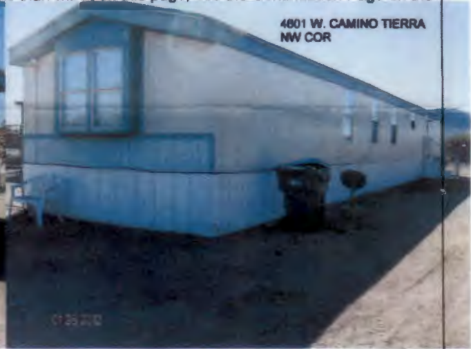
4601 W. CAMINO TIERRA NW COR