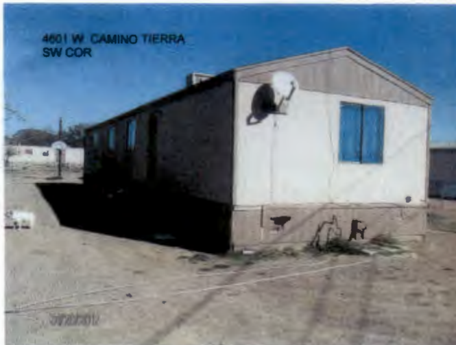
4801 W. CAMINO TIERRA SW COR