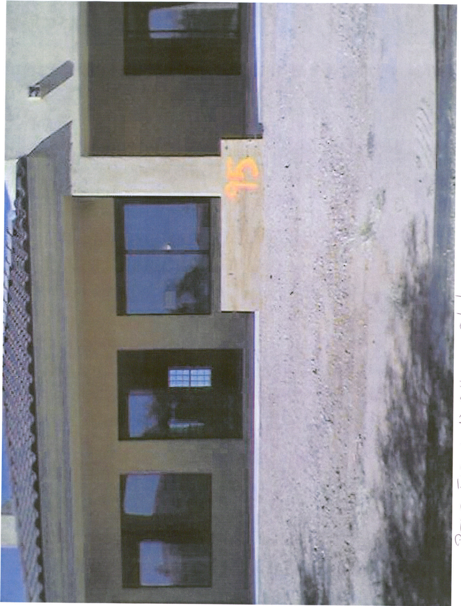
REAR FACING NORTH 9/19/97