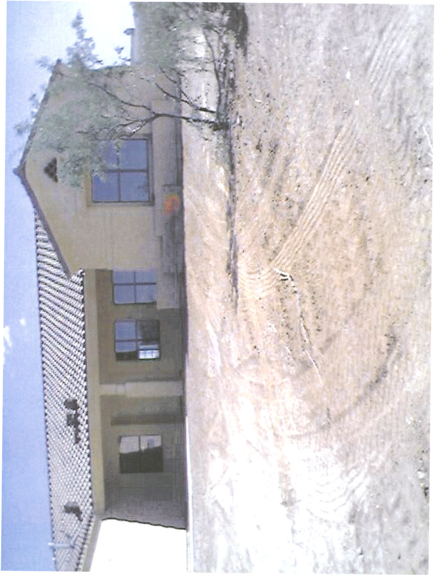
FRONT FACING SOUTH 9/19/07