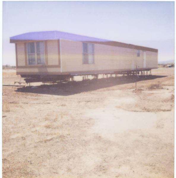
7105 Nelson Quihuis