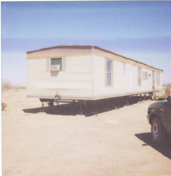
7105 Nelson Quihuis

If submitting more photographs than will fit on the preceding page, affix the additional photographs below. Identify all photographs with: date taken; "Front View" and "Rear View"; and, if required, "Right Side View" and "Left Side View."