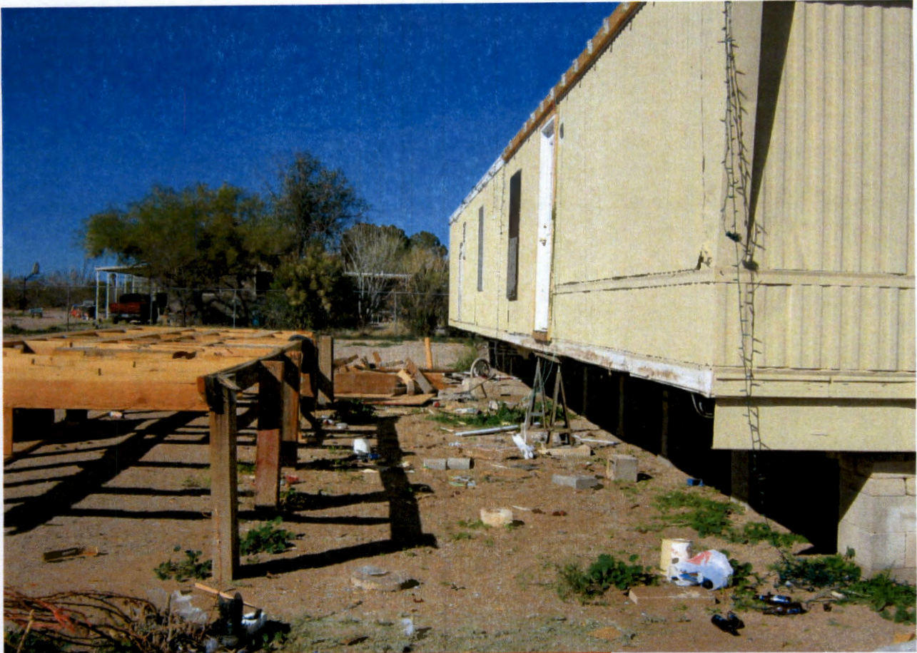
Porch removal verified by District staff 02/13/12.