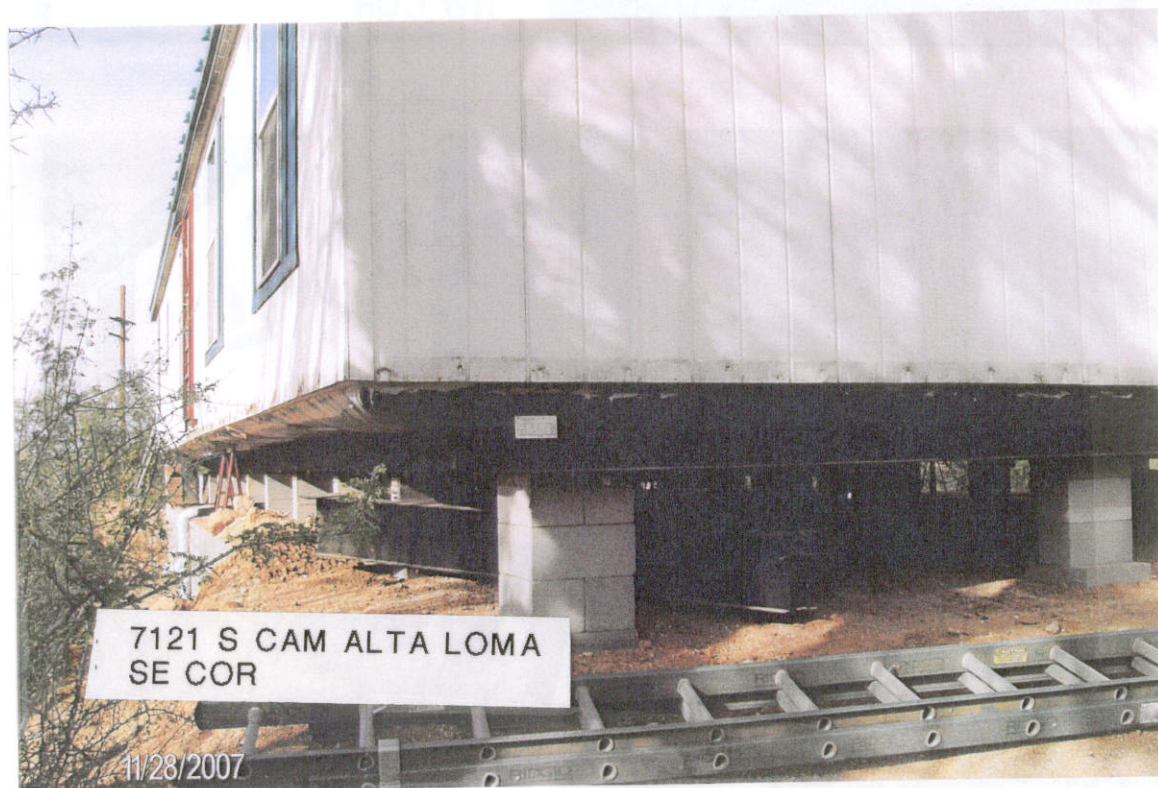
7121 S CAM ALTA LOMA SE COR