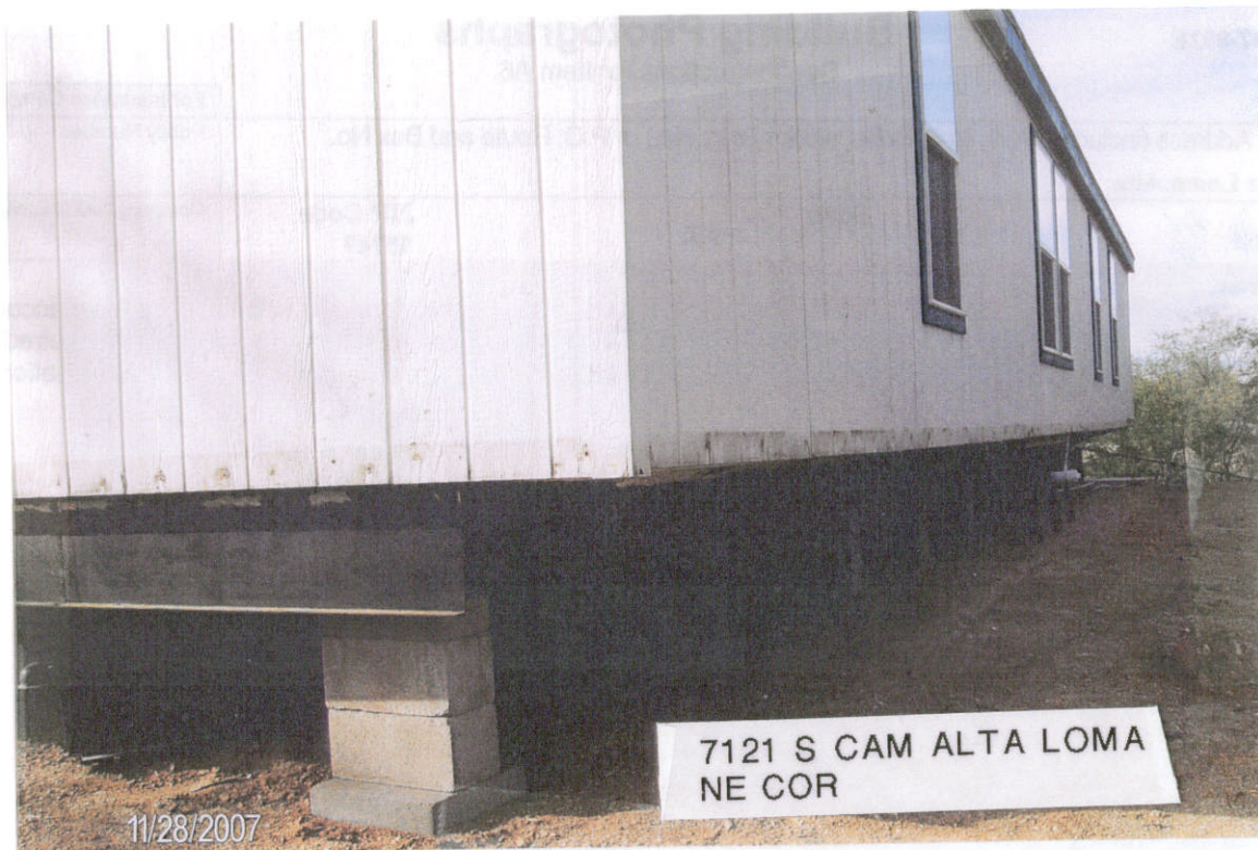
7121 S CAM ALTA LOMA NE COR