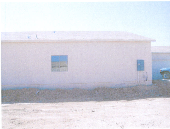
LEFT SIDE-LOOKING SOUTH