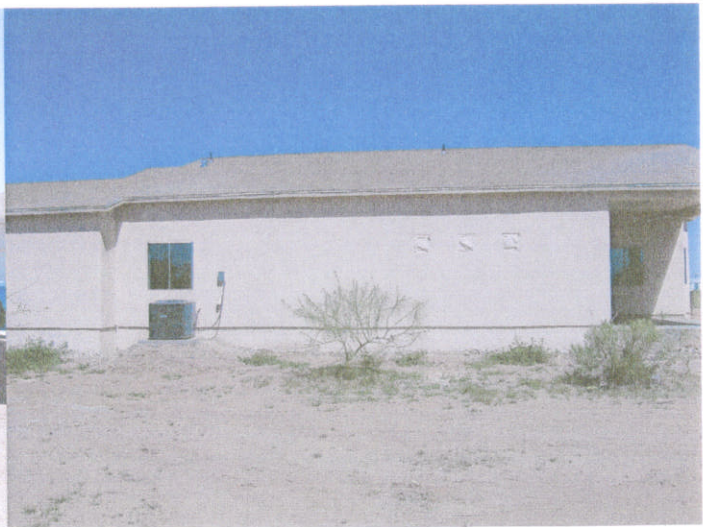
RIGHT SIDE-LOOKING NORTH