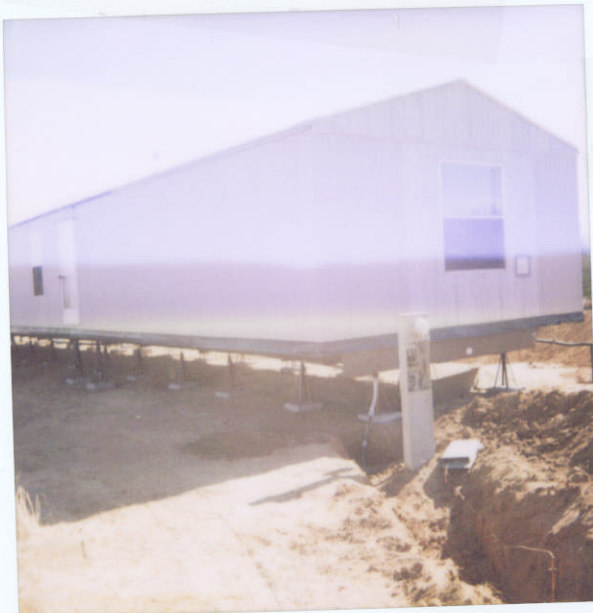
16241 SWEET JONQUIL SW CORNER