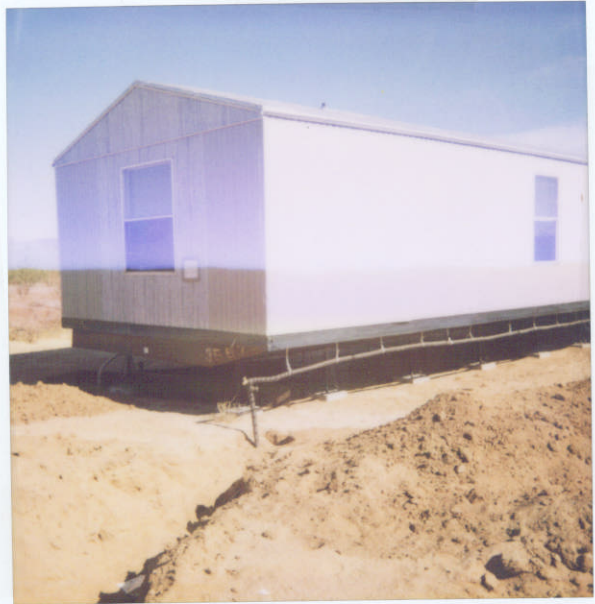
16241 SWEET JONQUIL SE CORNER