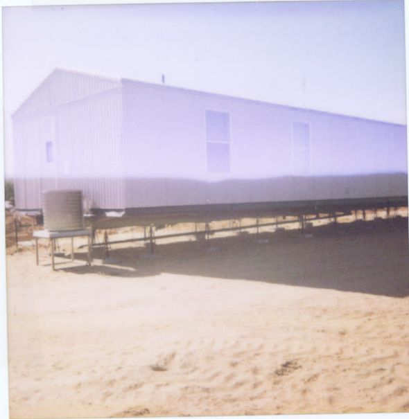
16241 SWEET JONQUIL NW CORNER