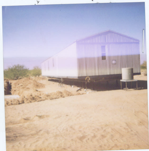
16241 SWEET JONQUIL NE CORNER