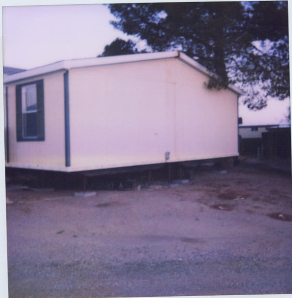
6131 ELM TREE LN SE CORNER