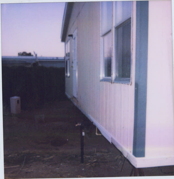
6131 ELM TREE LN NW CORNER