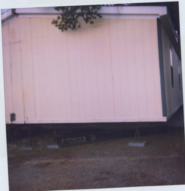
6131 ELM TREE LN NE CORNER