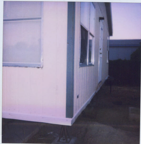
6131 ELM TREE LN SW CORNER