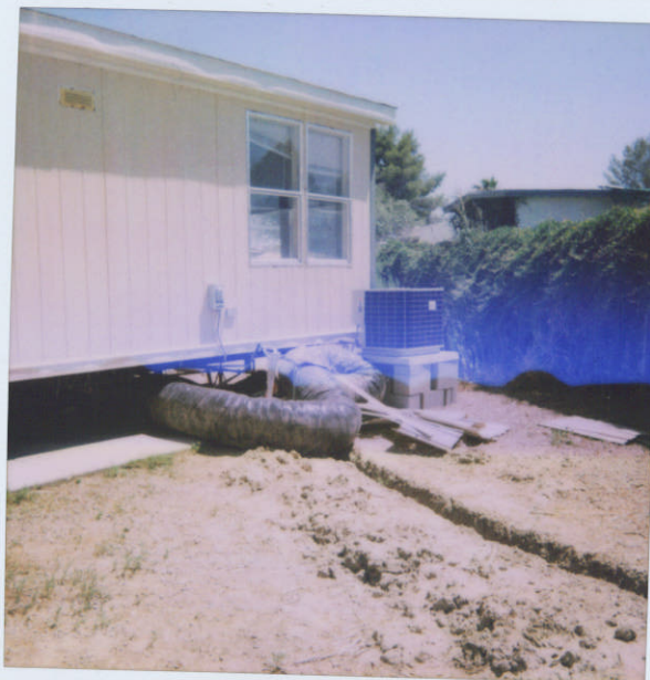
6131 ELM TREE LN NW CORNER

If submitting more photographs than will fit on the preceding page, affix the additional photographs below. Identify all photographs with: date taken; "Front View" and "Rear View"; and, if required, "Right Side View" and "Left Side View."