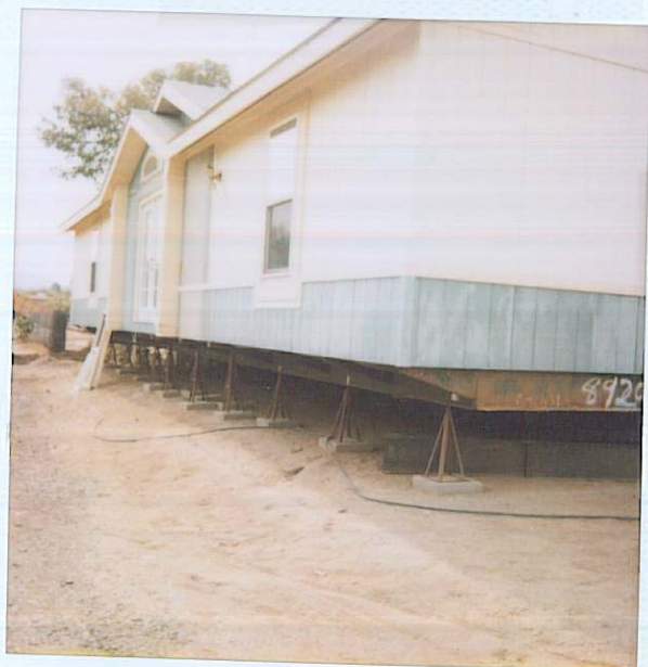
5641 W CORTARO 7-10-07 NW COR