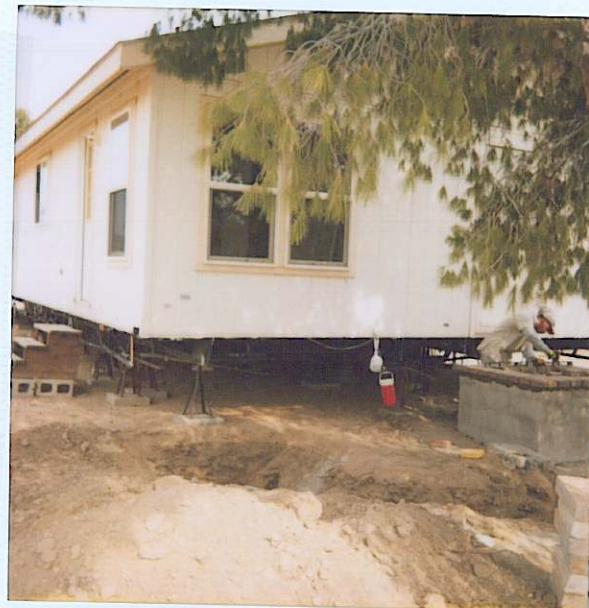
5641 W CORTARO 7-10-07 SE COR