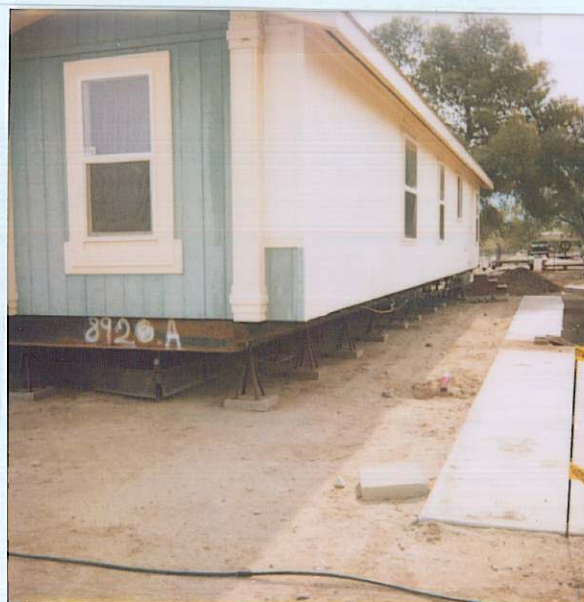
5641 W CORTARO 7-10-07 SW COR