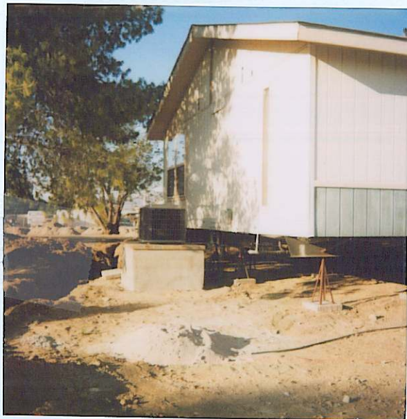
5641 W CORTARO 7-17-07 NE COR. CHANGING