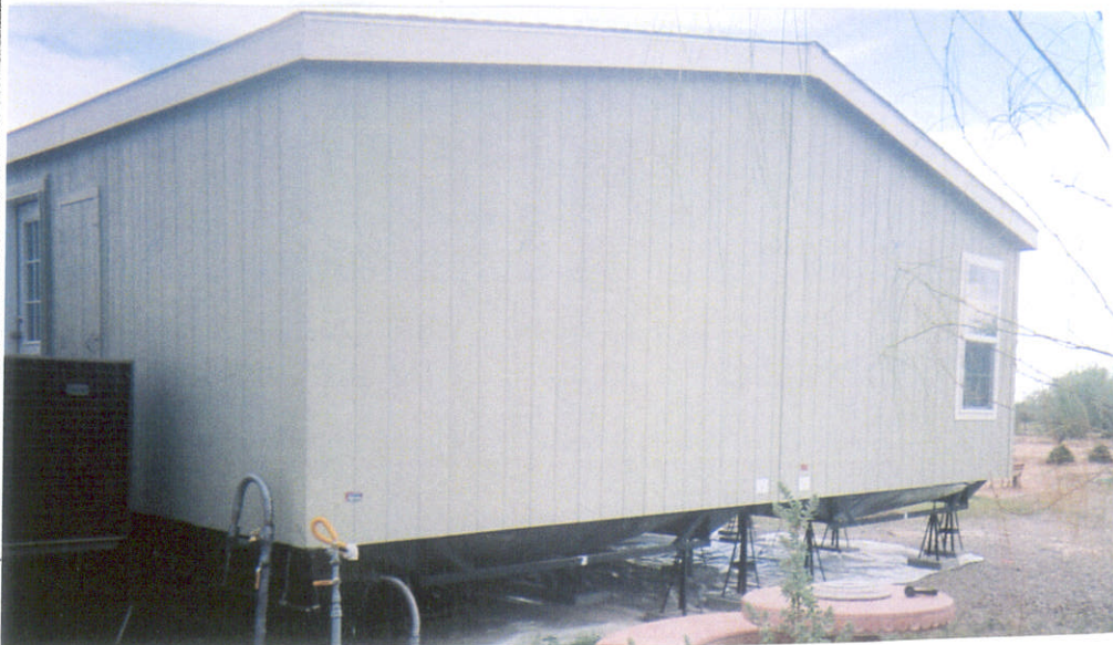
Left Side (East)