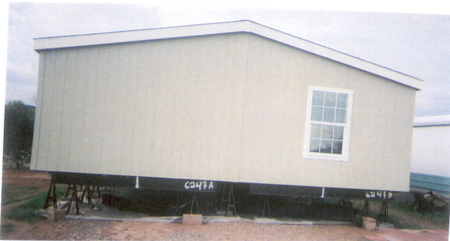
Right Side (West)