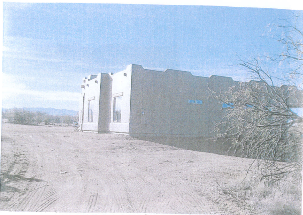
RIGHT SIDE ; FRONT 3/31/08