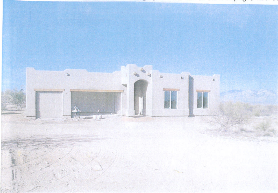
FRONT VIEW 3/31/08

If using the Elevation Certificate to obtain NFIP flood insurance, affix at least two building photographs below according to the instructions for Item A6. Identify all photographs by date taken; "Front View" and "Rear View"; and, if required, "Right Side View" and "Left Side View." If submitting more photographs than will fit on this page, use the Continuation Page, following.