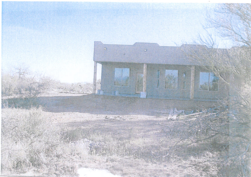
REAR VIEW 3/31/08