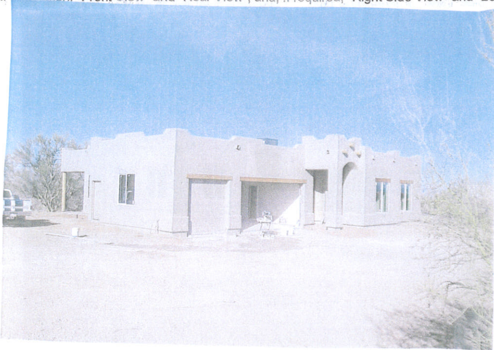
FRONT ; LEFT SIDE 3/31/08

If submitting more photographs than will fit on the preceding page, affix the additional photographs below. Identify all photographs with: date taken: "Front View" and "Rear View"; and, if required, "Right Side View" and "Left Side View."