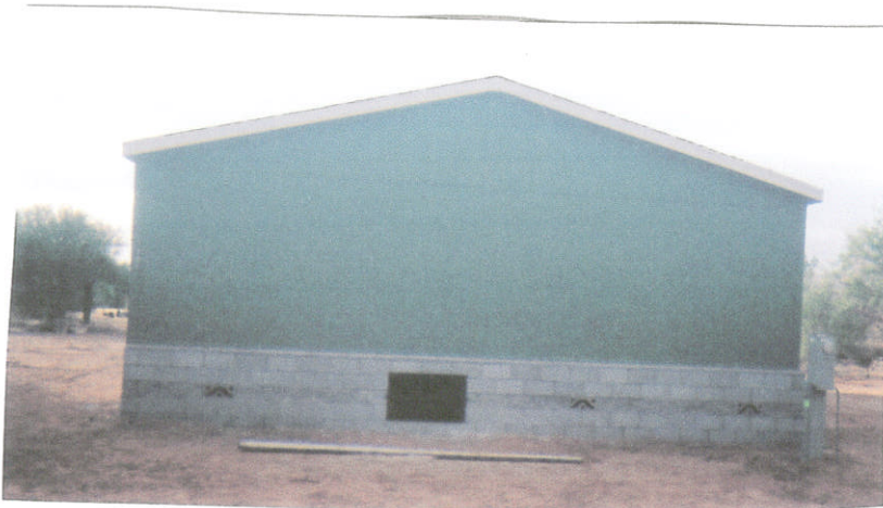
Right side (East)