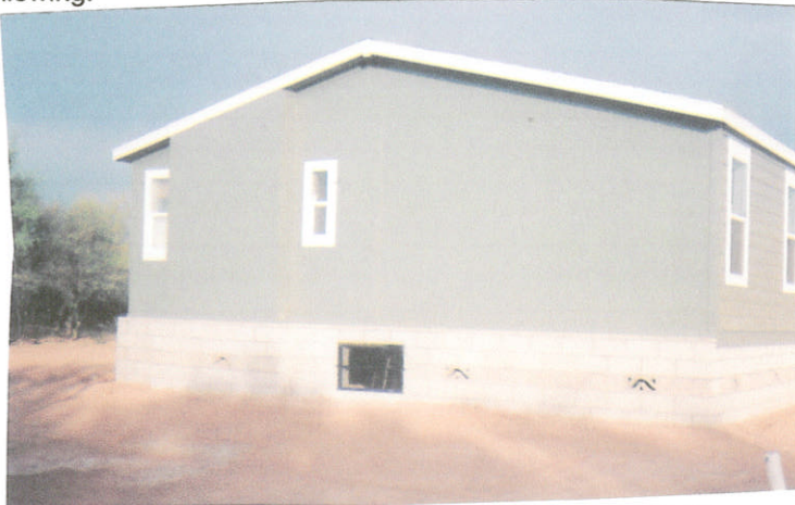
Left side (west)

If using the Elevation Certificate to obtain NFIP flood insurance, affix at least Four building photographs below according to the instructions for Item A6. Identify all photographs with: date taken; "Front View" and "Rear View"; and, if required, "Right Side View" and "Left Side View." If submitting more photographs than will fit on this page, use the Continuation Page, following.