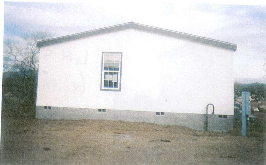
Right Side (south)