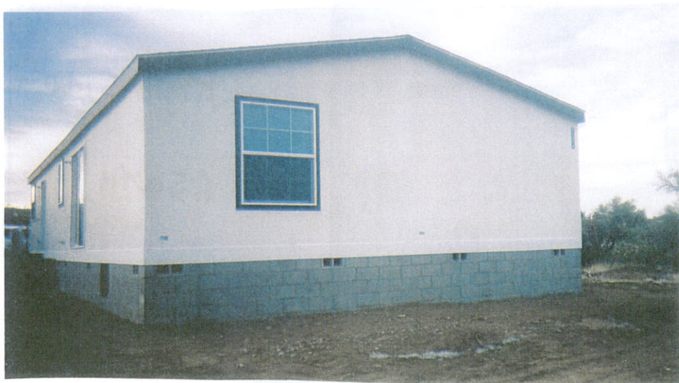
Left Side (North)