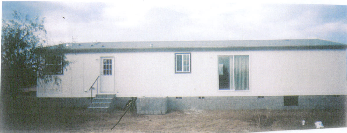
Back (East) stand (base) for heat Pump

If submitting more photographs than will fit on the preceding page, affix the additional photographs below. Identify all photographs with: date taken; "Front View" and "Rear View"; and, if required, "Right Side View" and "Left Side View."