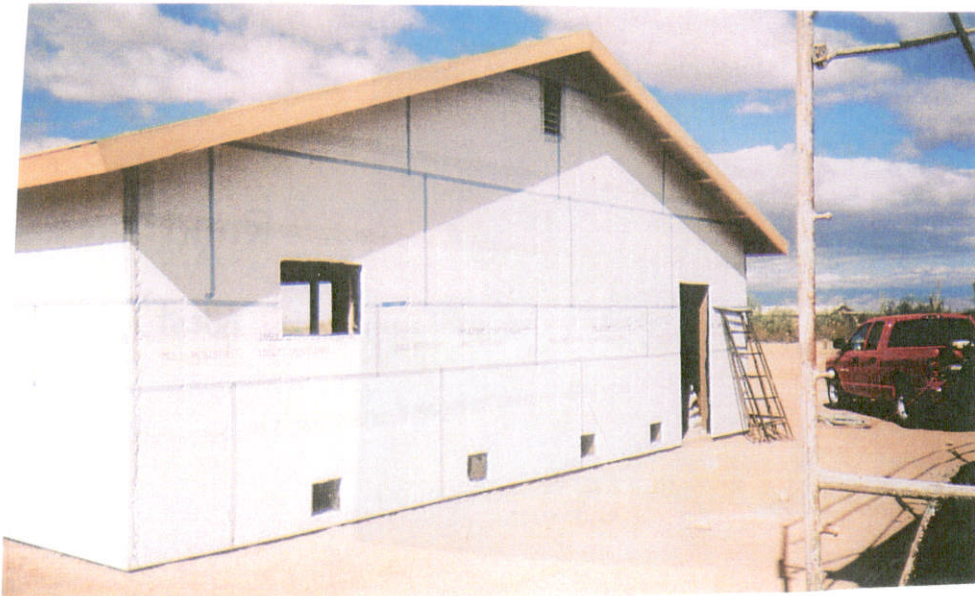
Left Side (East)