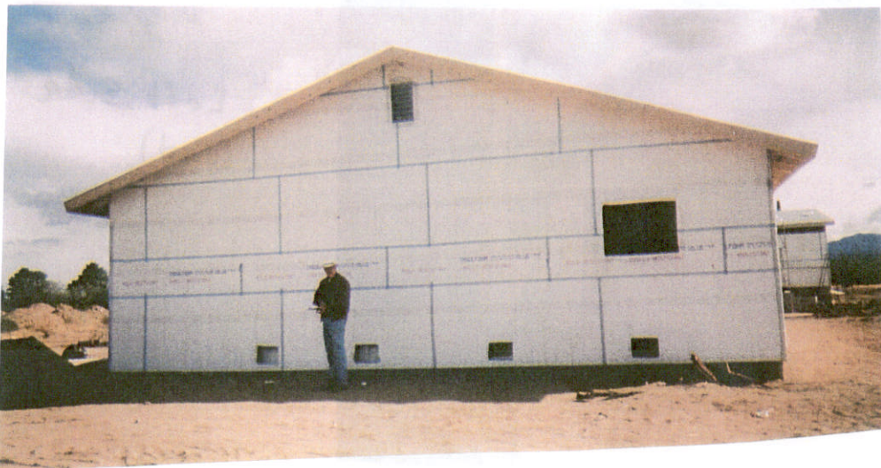
Right Side (West)