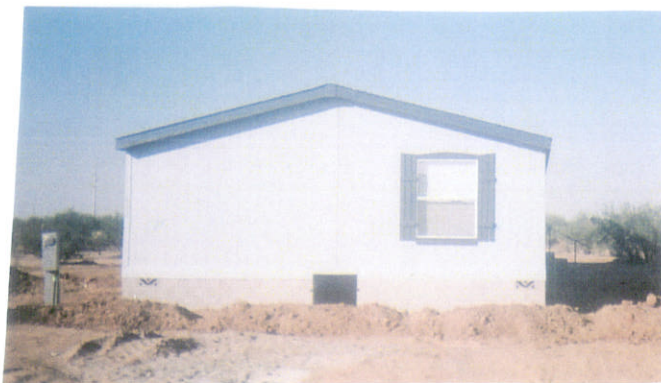
Right Left Side (South)