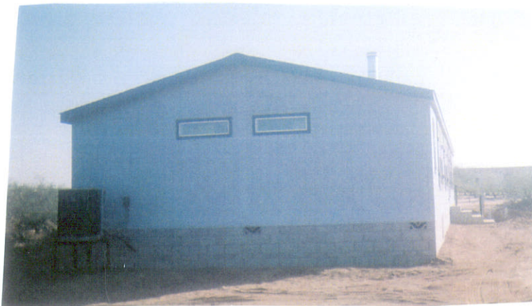
Left Side (North)