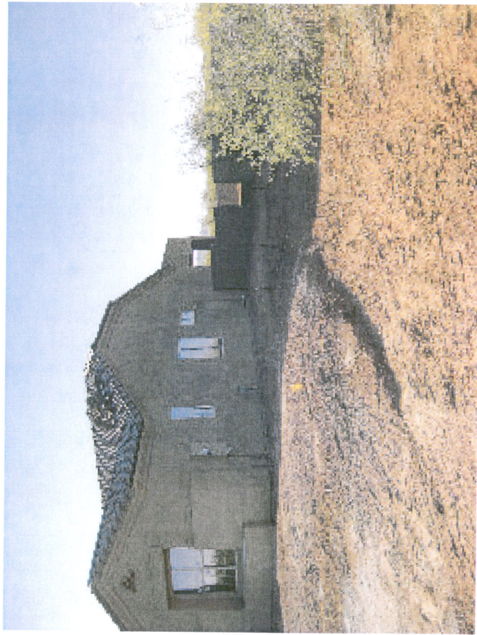
RIGHT Side looking South East