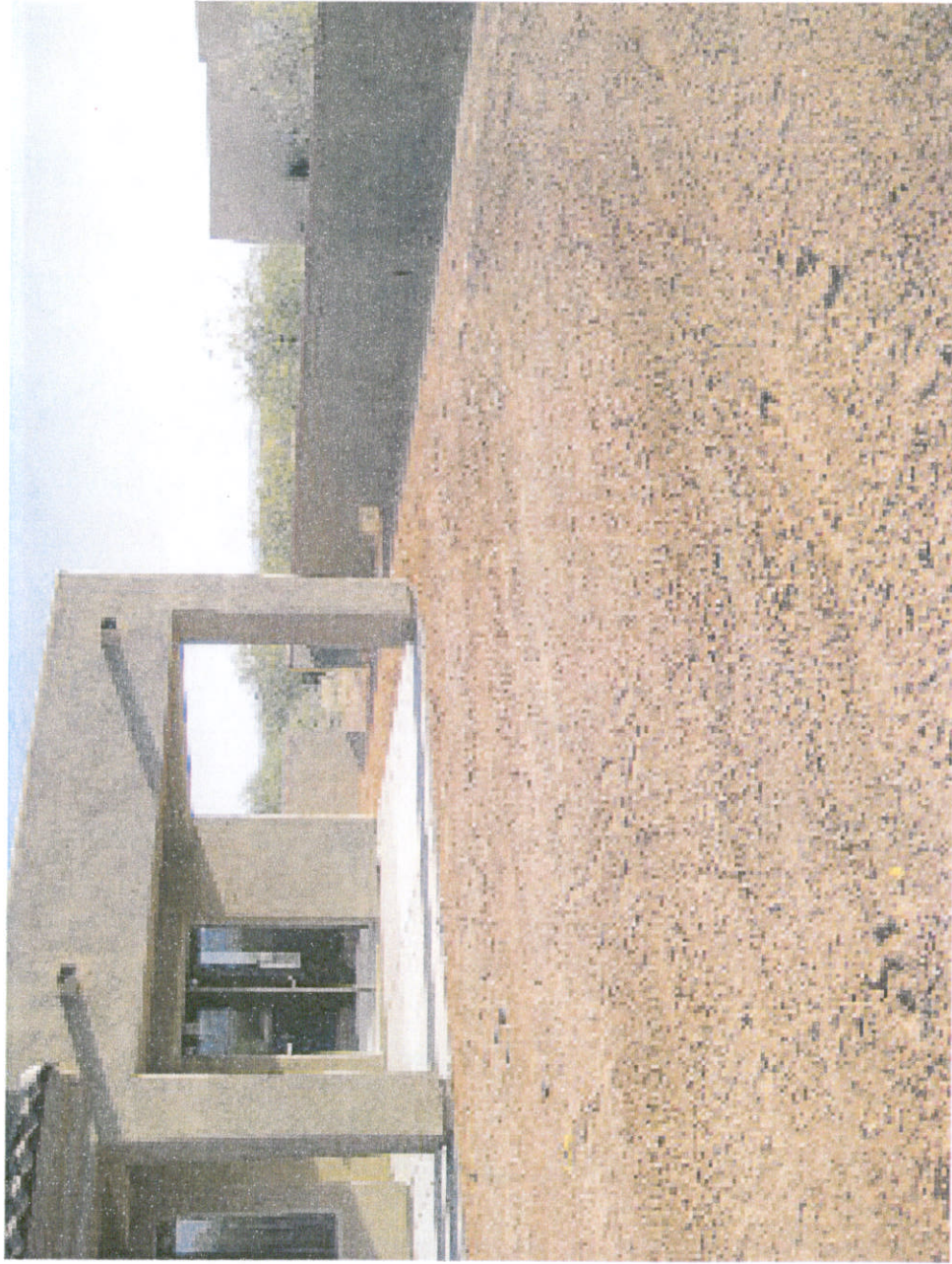
REAR LOOKING NORTH EAST