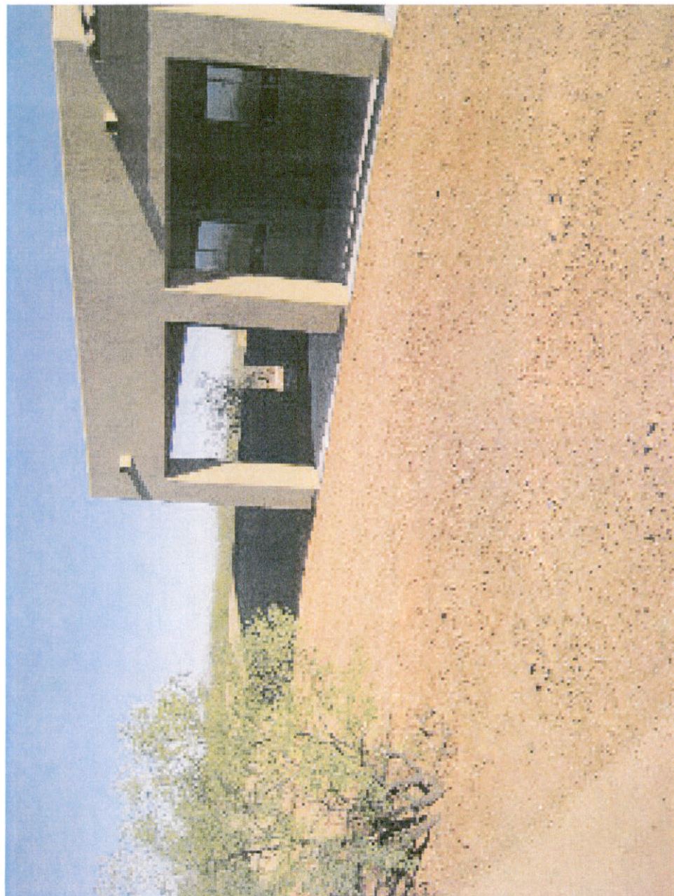
REAR LOOK WY NORTH WEST