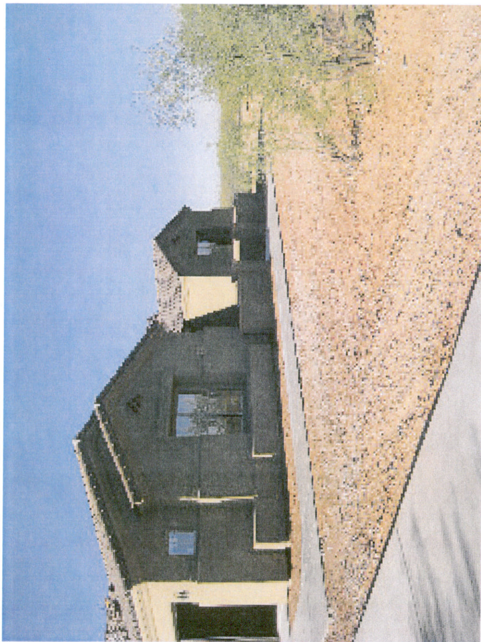
FRONT looking SOUTH WEST