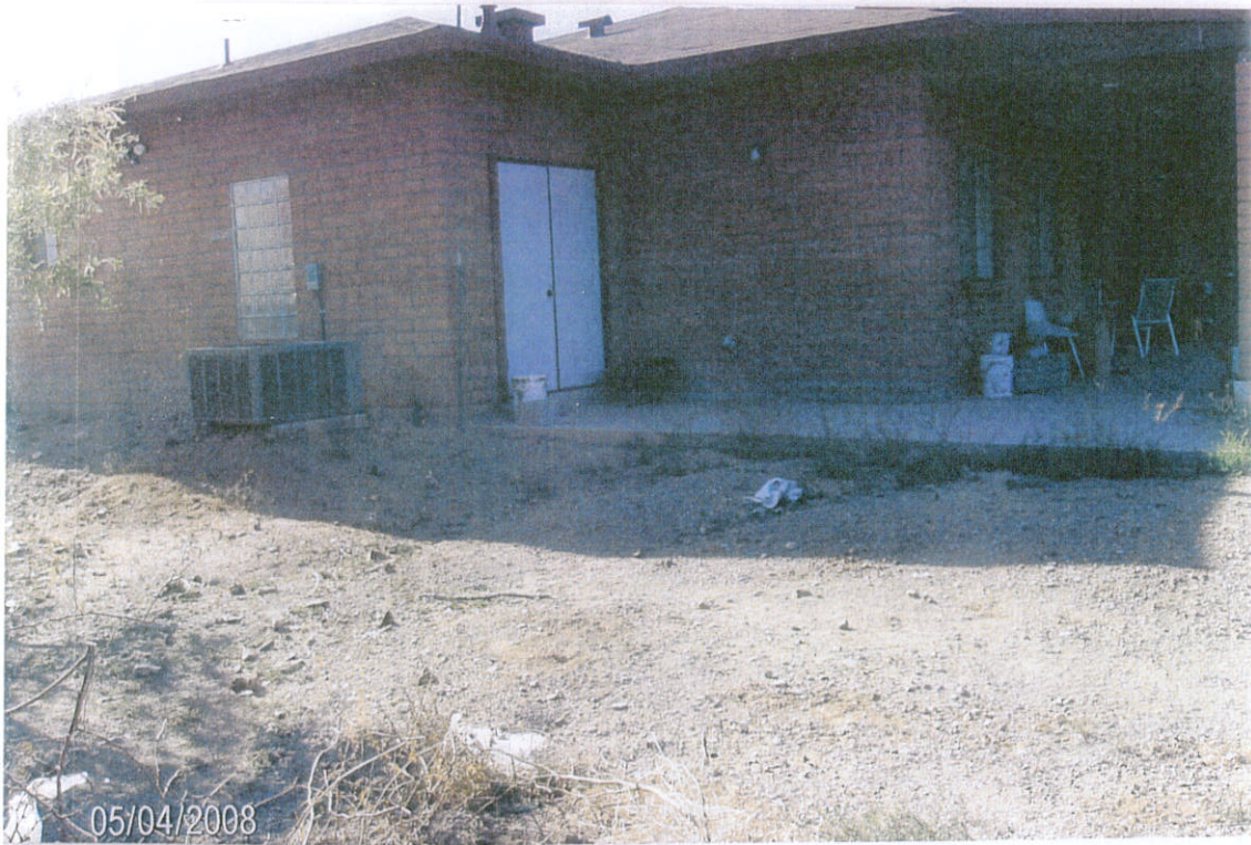
4791 W. ENGLETAIL NW CON