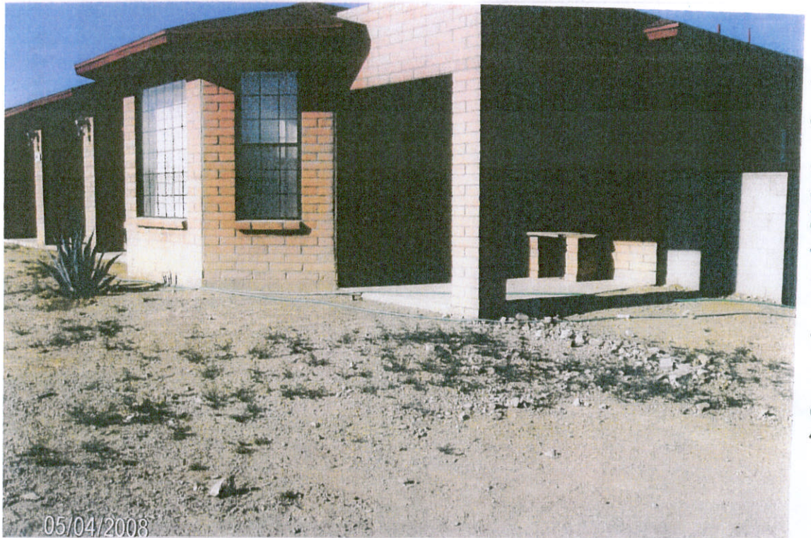
4791 W. ENGLETAIL NE COR