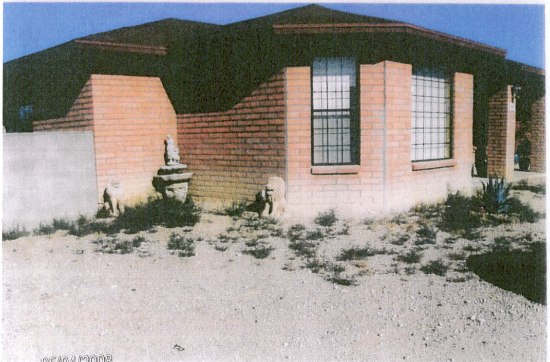
4791 W. ENGLETAIL SE COR