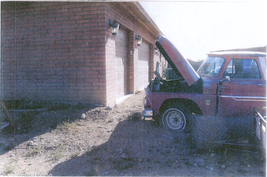
4771 W. ENGLETAIL SW CON