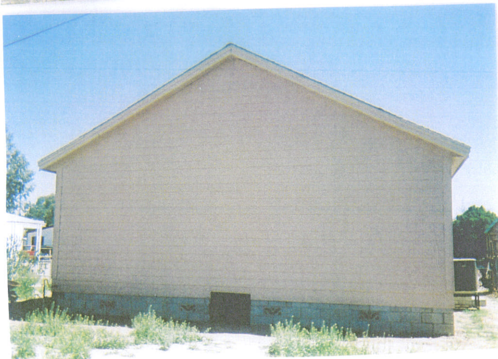
Right Side (West)