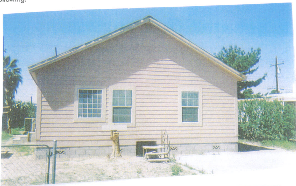
Left Side (East) (street side)

If using the Elevation Certificate to obtain NFIP flood insurance, affix at least Four building photographs below according to the instructions for Item A6. Identify all photographs with: date taken; "Front View" and "Rear View"; and, if required, "Right Side View" and "Left Side View." If submitting more photographs than will fit on this page, use the Continuation Page, following.