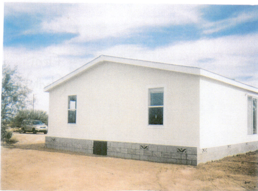
Right Side (West)