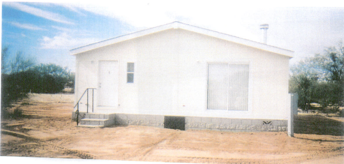
Left Side (East)

If using the Elevation Certificate to obtain NFIP flood insurance, affix at least Four building photographs below according to the instructions for Item A6. Identify all photographs with: date taken; "Front View" and "Rear View"; and, if required, "Right Side View" and "Left Side View." If submitting more photographs than will fit on this page, use the Continuation Page, following.