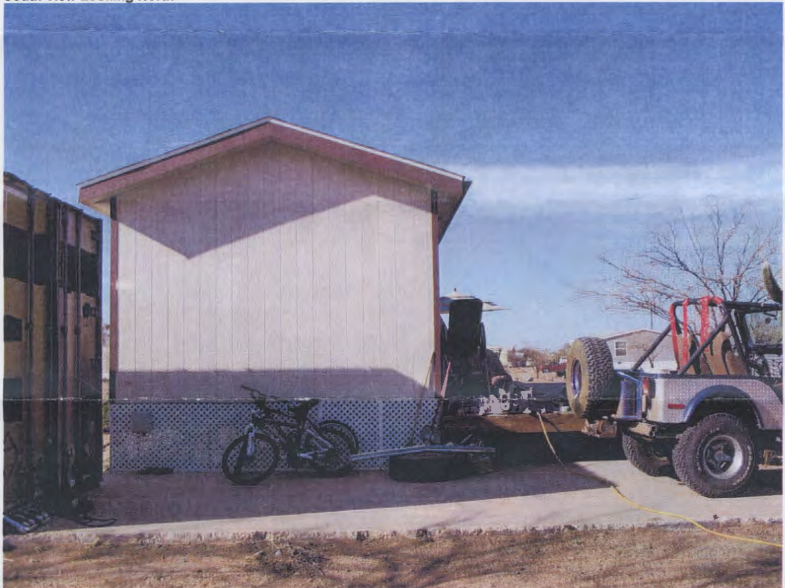
South View Looking North