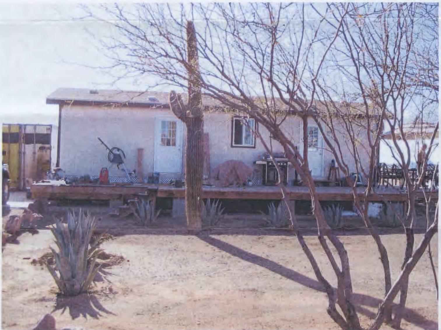
East View Looking West