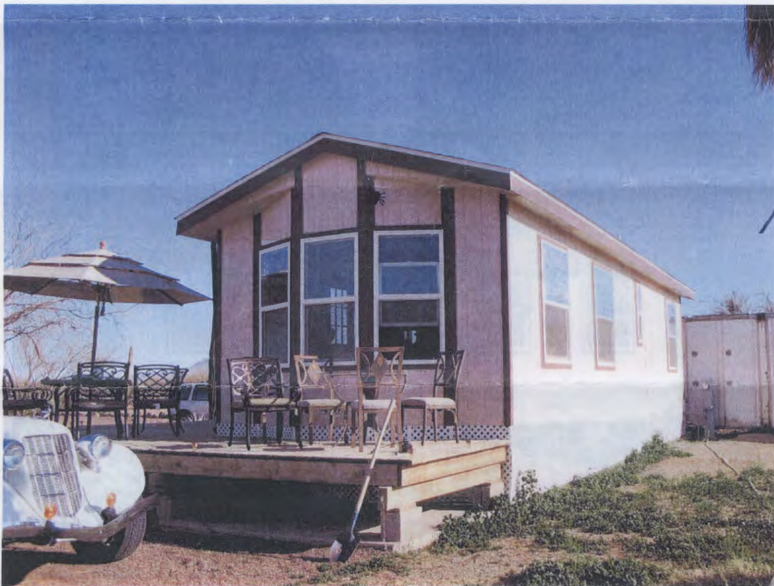
North View Looking South