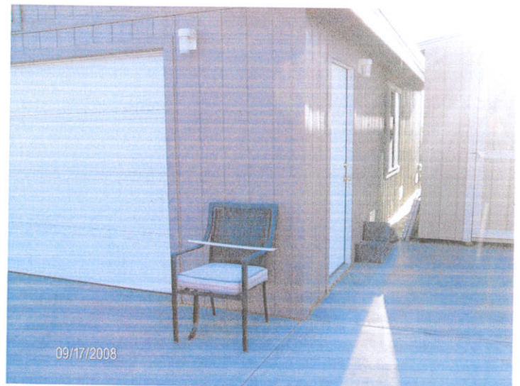
9/17/2008 15959 W. SPUR BELL SW COR