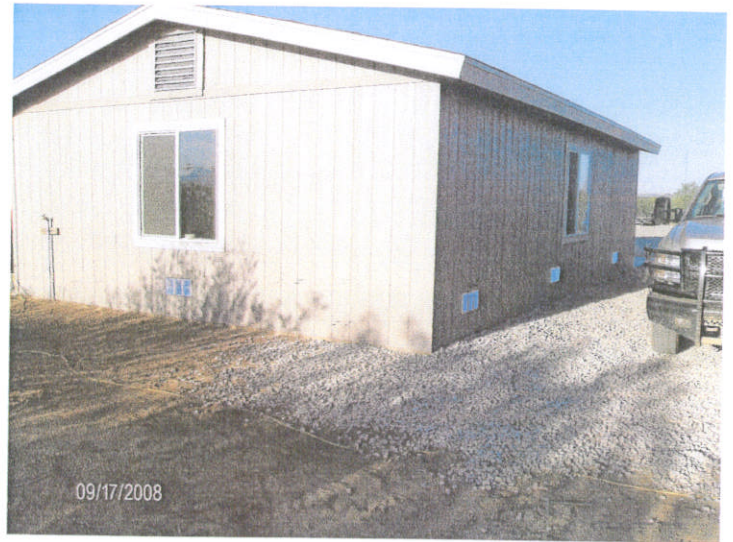
9/17/2008 15959 W. SPUR BELL NE COR