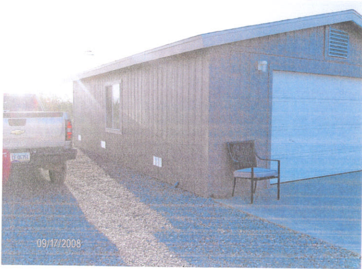
9/17/2008 15959 W. SPUR BELL NW COR