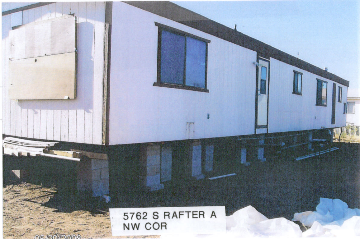
5762 S RAFTER A NW COR