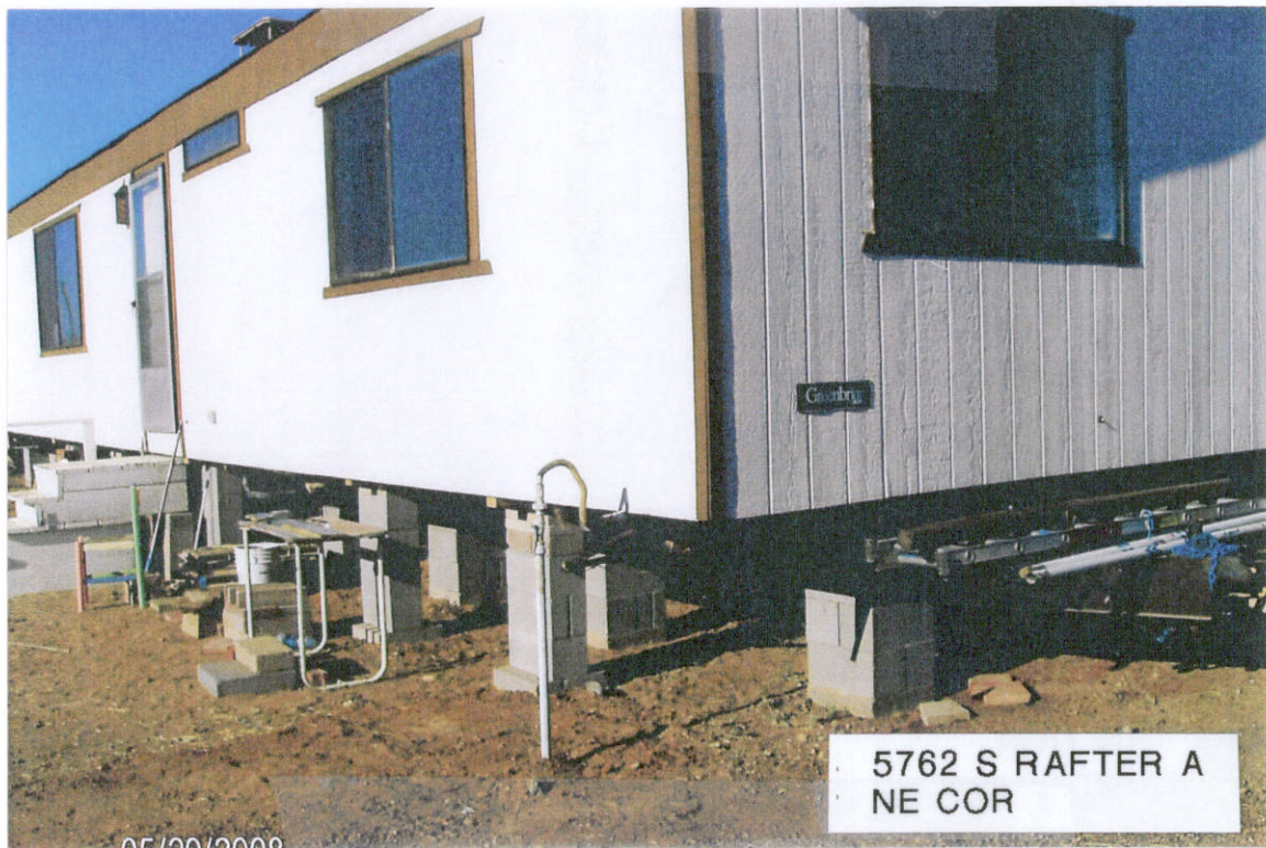
5762 S RAFTER A NE COR