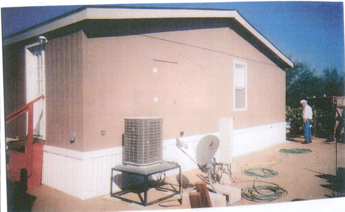
Left Side (East)

If submitting more photographs than will fit on the preceding page, affix the additional photographs below. Identify all photographs with: date taken; "Front View" and "Rear View"; and, if required, "Right Side View" and "Left Side View."