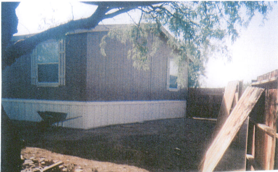
Right Side (west)

If submitting more photographs than will fit on the preceding page, affix the additional photographs below. Identify all photographs with: date taken; "Front View" and "Rear View"; and, if required, "Right Side View" and "Left Side View."