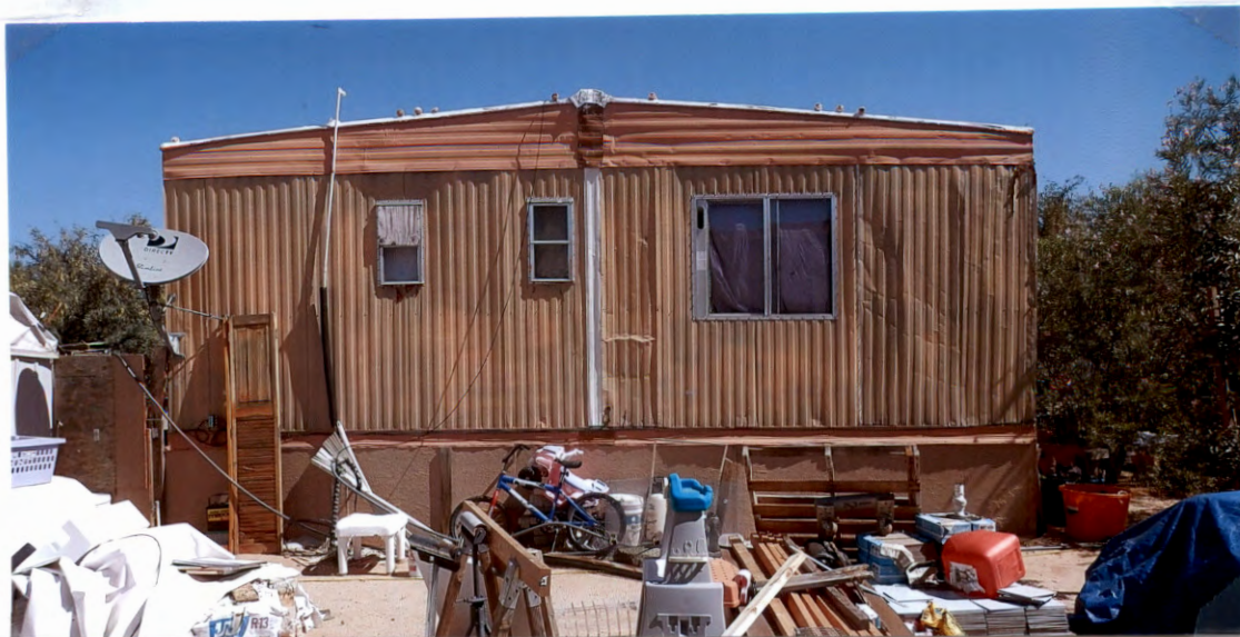
LEFT SIDE VIEW — SOUTH — 7-21-15