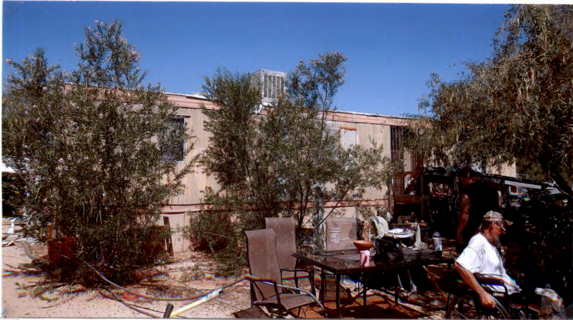
FRONT VIEW — EAST — 7-21-15

If using the Elevation Certificate to obtain NFIP flood insurance, affix at least 2 building photographs below according to the instructions for Item A6. Identify all photographs with date taken; "Front View" and "Rear View"; and, if required, "Right Side View" and "Left Side View." When applicable, photographs must show the foundation with representative examples of the flood openings or vents, as indicated in Section A8. If submitting more photographs than will fit on this page, use the Continuation Page.