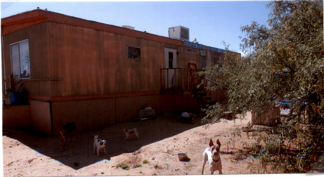
REAR VIEW — WEST — 7-21-15

If submitting more photographs than will fit on the preceding page, affix the additional photographs below. Identify all photographs with: date taken; "Front View" and "Rear View"; and, if required, "Right Side View" and "Left Side View." When applicable, photographs must show the foundation with representative examples of the flood openings or vents, as indicated in Section A8.