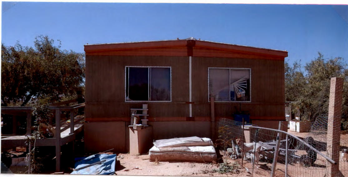
RIGHT SIDE VIEW — NORTH — 7-21-15