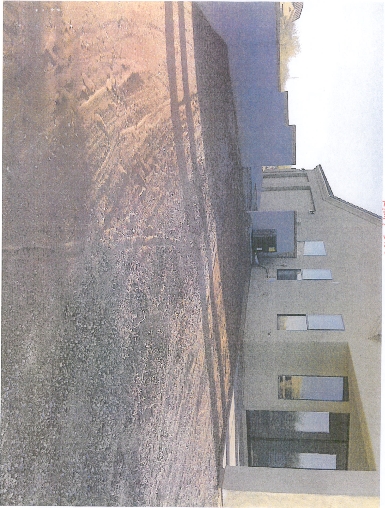
Figure 1. 2180