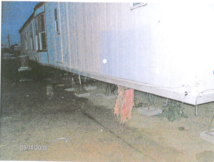
8/14/2008 6611 W LIGHTNING SE COR