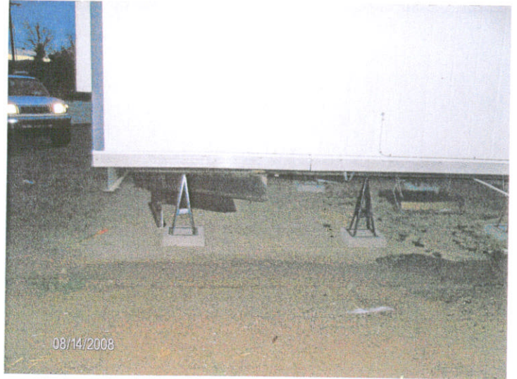
8/14/2008 6611 W LIGHTNING SW COR