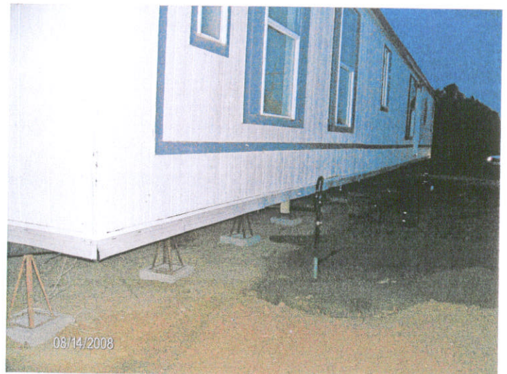
8/14/2008 6611 W LIGHTNING NE COR