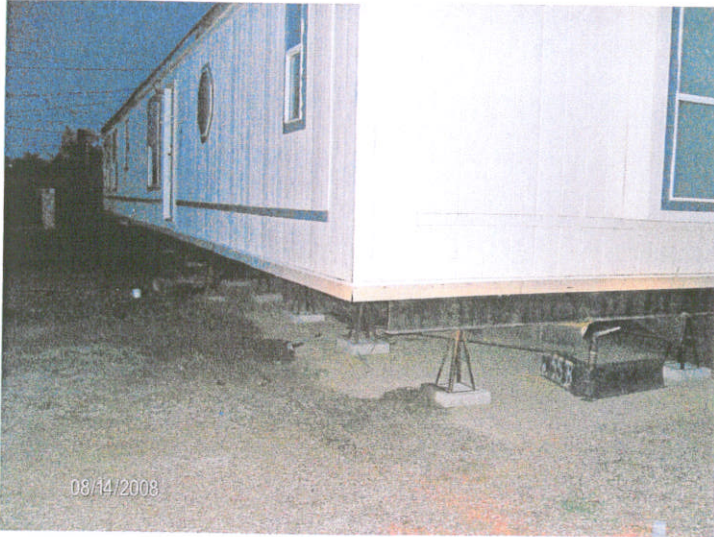
8/14/2008 6611 W LIGHTNING NW COR