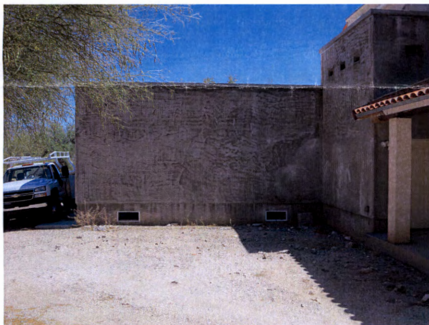
North View photo taken June 2, 2015

If using the Elevation Certificate to obtain NFIP flood insurance, affix at least 2 building photographs below according to the instructions for Item A6. Identify all photographs with date taken; "Front View" and "Rear View"; and, if required, "Right Side View" and "Left Side View." When applicable, photographs must show the foundation with representative examples of the flood openings or vents, as indicated in Section A8. If submitting more photographs than will fit on this page, use the Continuation Page.