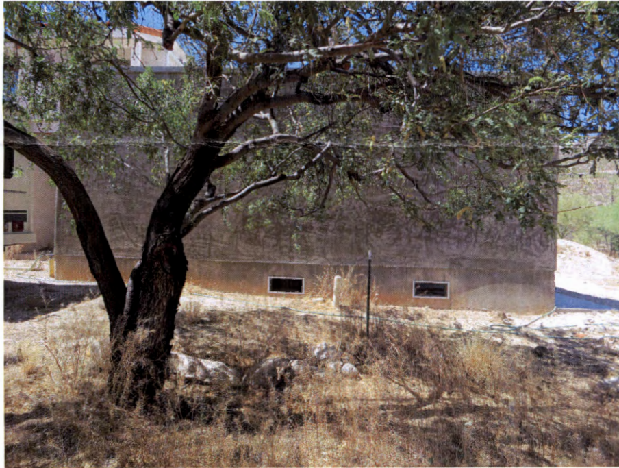
South View photo taken June 2, 2015

If submitting more photographs than will fit on the preceding page, affix the additional photographs below. Identify all photographs with: date taken; "Front View" and "Rear View"; and, if required, "Right Side View" and "Left Side View." When applicable, photographs must show the foundation with representative examples of the flood openings or vents, as indicated in Section A8.