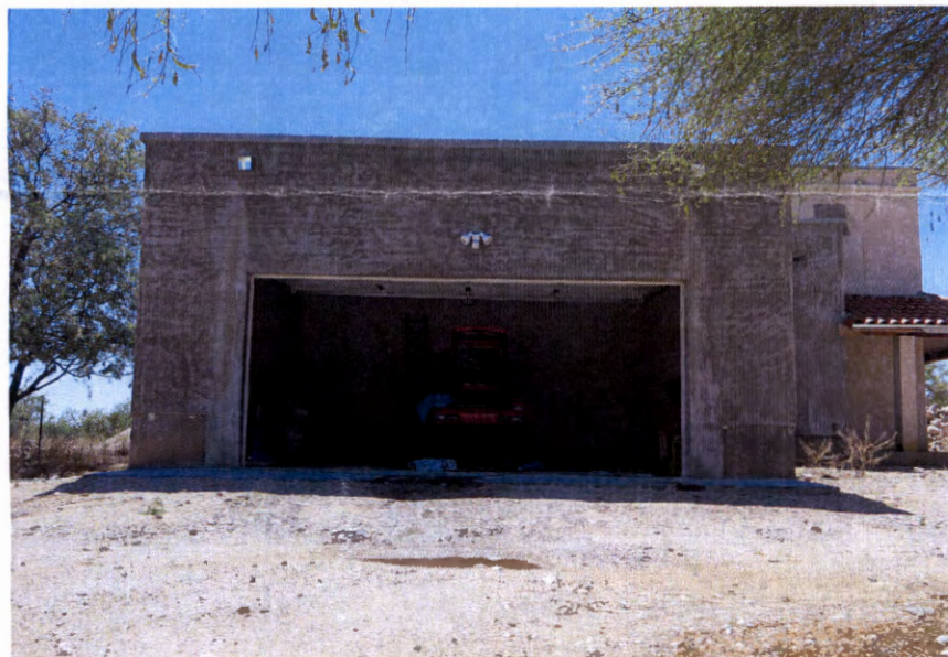
East View photo taken June 2, 2015