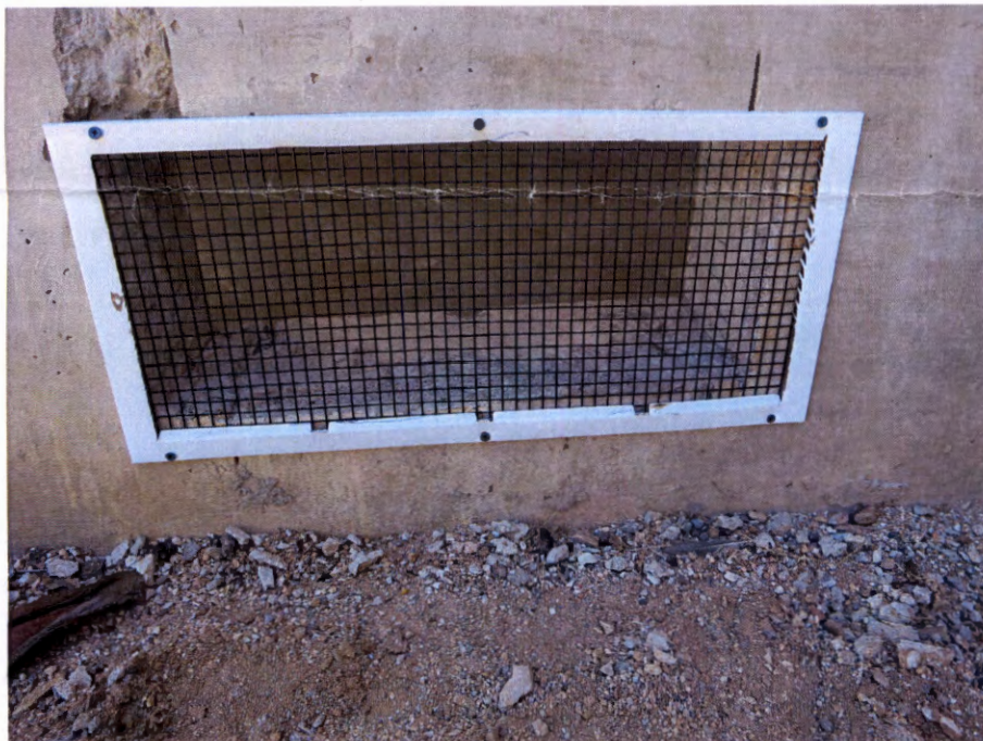
Typical Screened Vent 9.5" x 22.5" each photo taken June 2, 2015