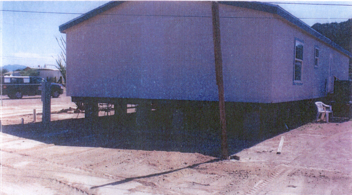
Right side (west)