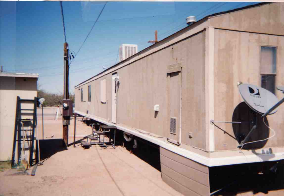
Rear View 02/29/12 DOL